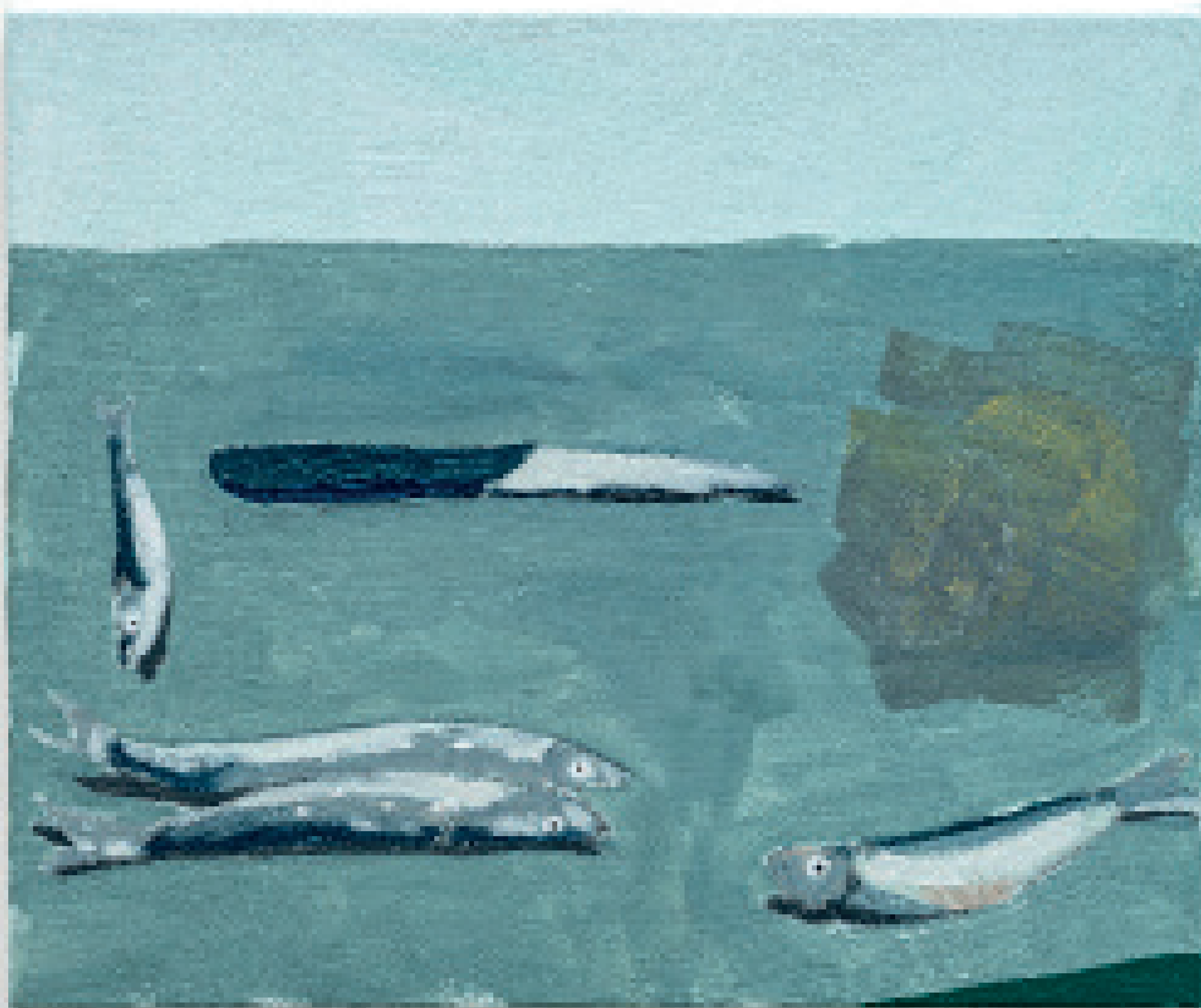
Knife / Sardines, 2021 Acrylic on canvas / Aluminum stretcher 33.5 x 40 cm (13 1/4 x 15 3/4 in.) Unique