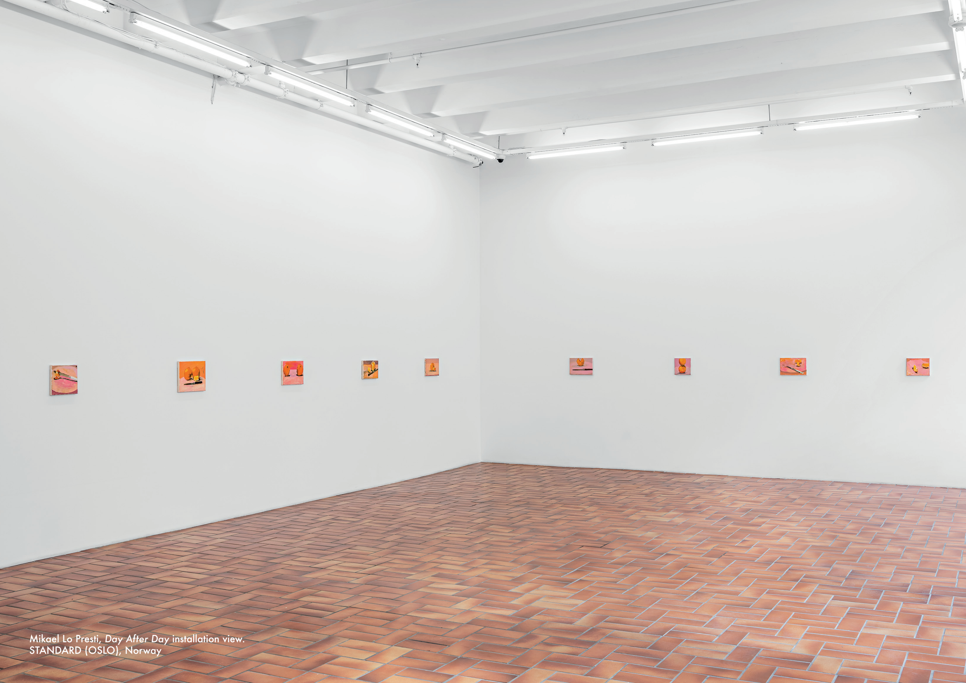
Mikael Lo Presti, Day After Day installation view. STANDARD (OSLO), Norway