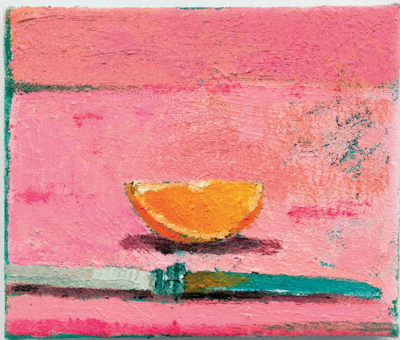
Still Life with Orange #35, 2023 Oil on canvas 18 x 22 cm (7 1/8 x 8 5/8 in.) Unique