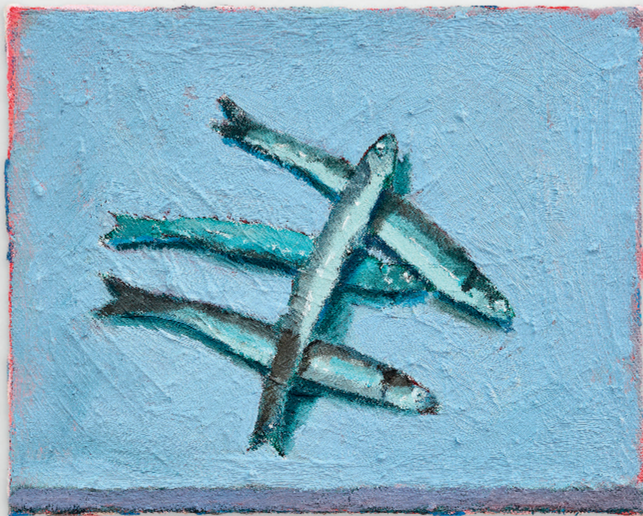
Still Life With Sardines I , 2023 Oil on canvas 23 x 29 cm (9 x 11 2/5 in.) Unique