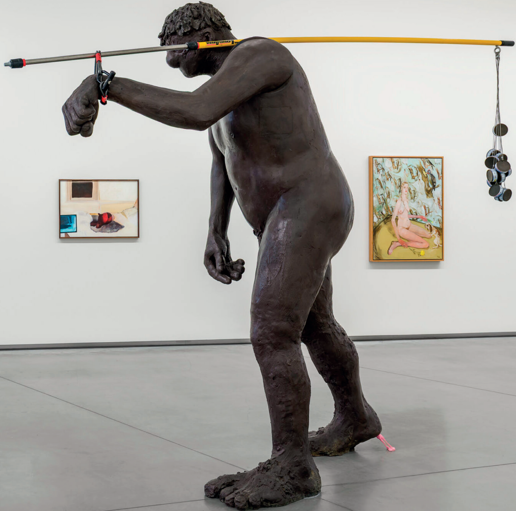
Exhibition view, Astrup Fearnley Collection, Astrup Fearnley Museet, Oslo, 2025