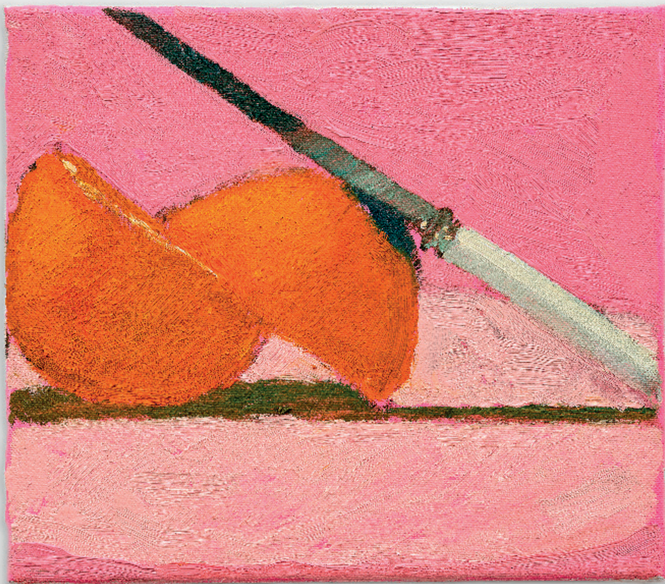
Still Life with Orange #37, 2023 Oil on canvas 22 x 24 cm (8 5/8 x 9 1/2 in.) Unique