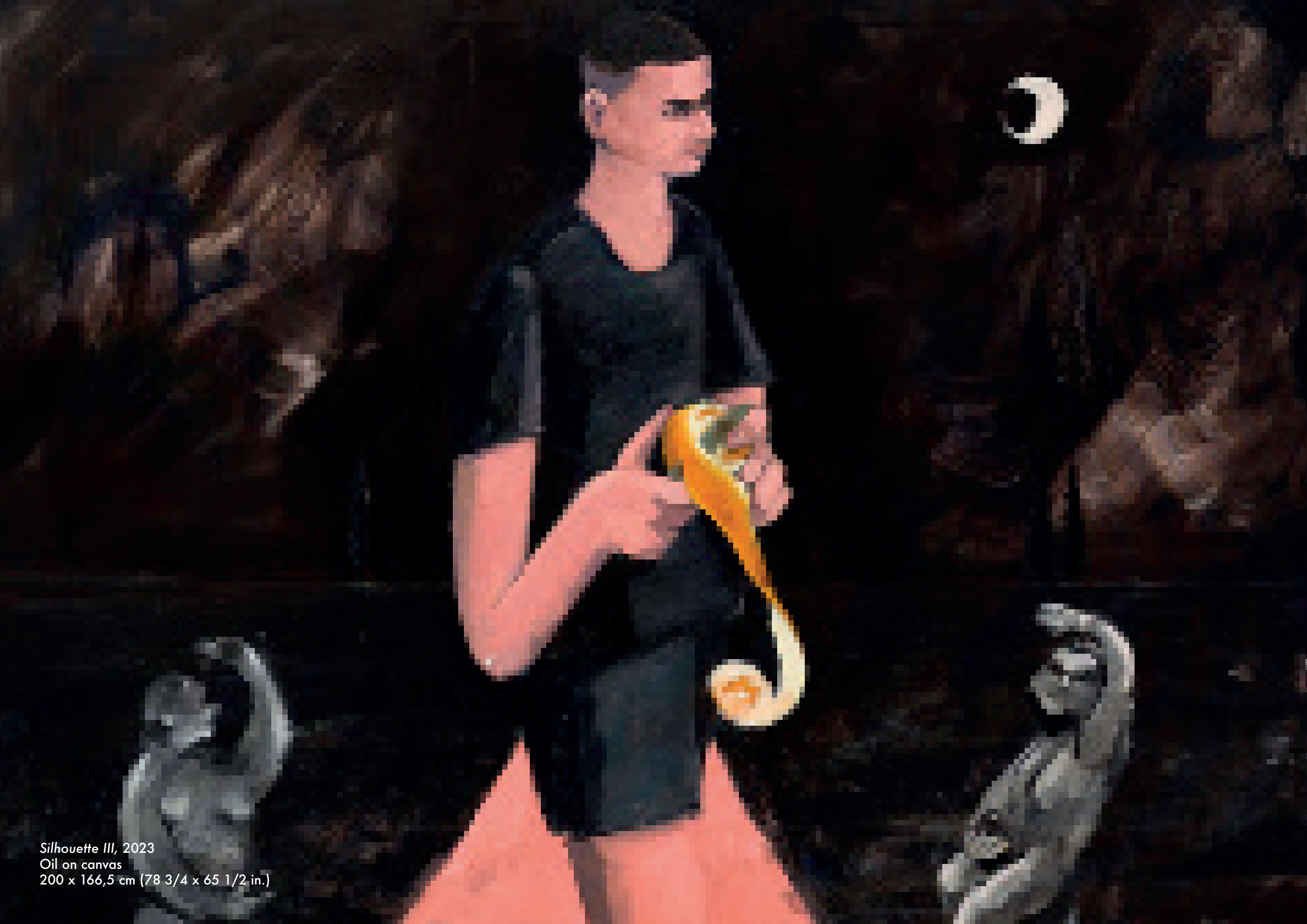
Silhouette III , 2023 Oil on canvas 200 x 166,5 cm (78 3/4 x 65 1/2 in.)