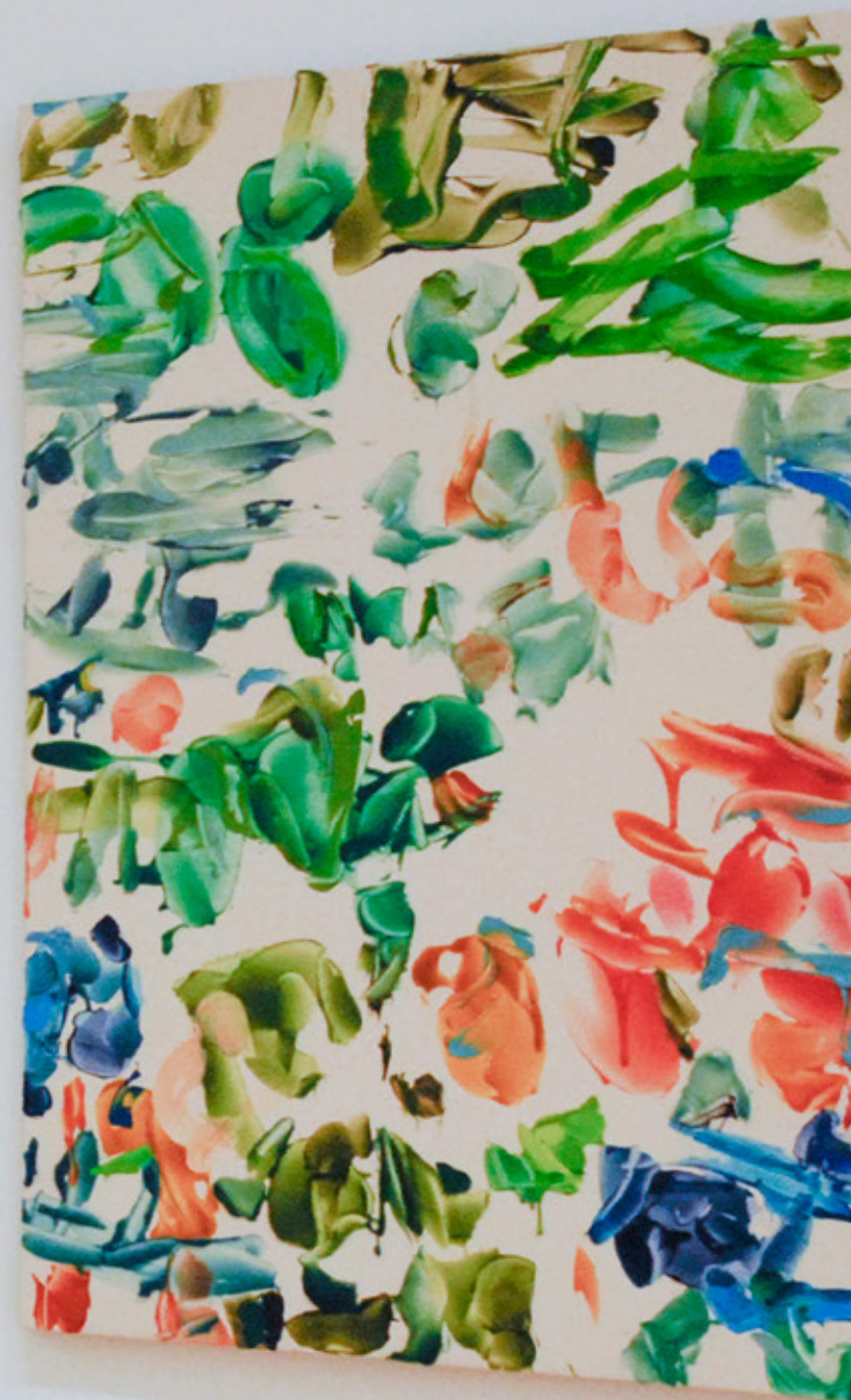
Kenjiro Okazaki, Retrospective Strata, 2020 Exhibition view, Toyota Municipal Museum of Art, Tokyo