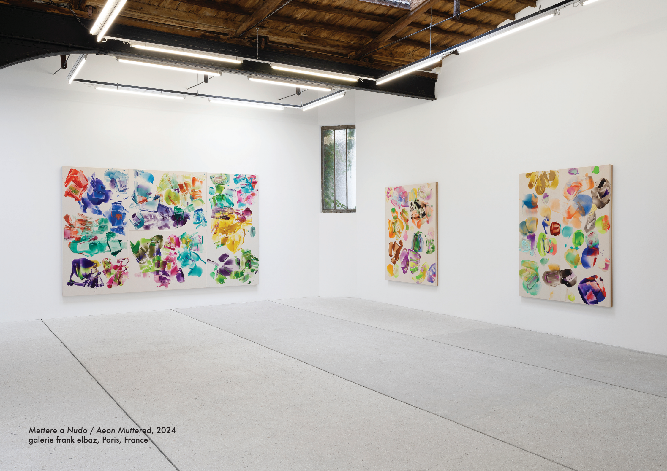
Mettere a Nudo / Aeon Muttered, 2024 galerie frank elbaz, Paris, France