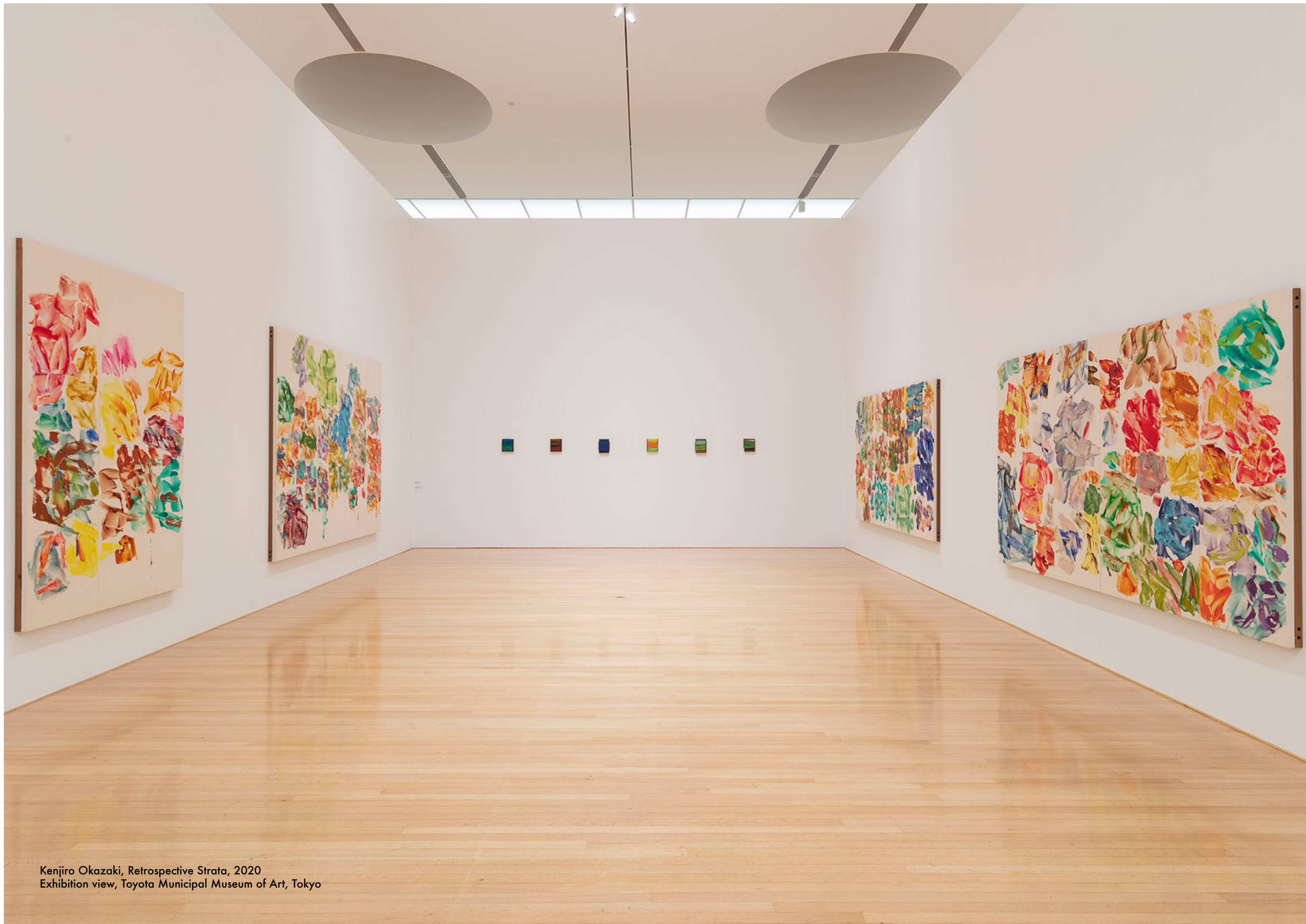
Kenjiro Okazaki, Retrospective Strata, 2020 Exhibition view, Toyota Municipal Museum of Art, Tokyo