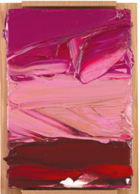
岡崎乾二郎 Kenjiro Okazaki — The Monkey Mind and the Idea Horse / 壁観 L'esprit de singe et l'Idée de cheval / Contempler le mur — 2020 アクリリック・キャンバス acrylique sur toile 25,0 × 18,0 × 3,0 cm