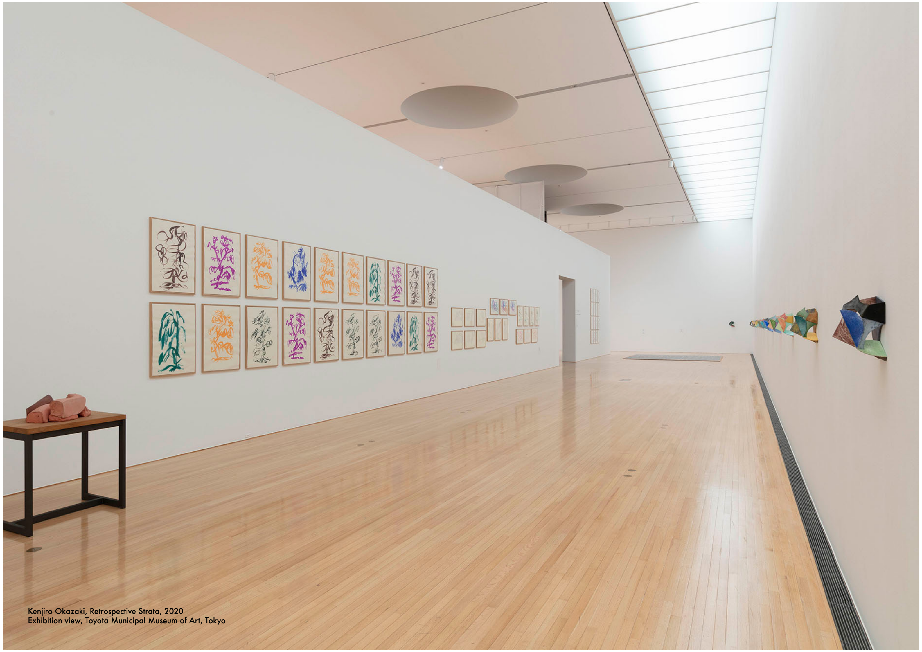
Kenjiro Okazaki, Retrospective Strata, 2020 Exhibition view, Toyota Municipal Museum of Art, Tokyo