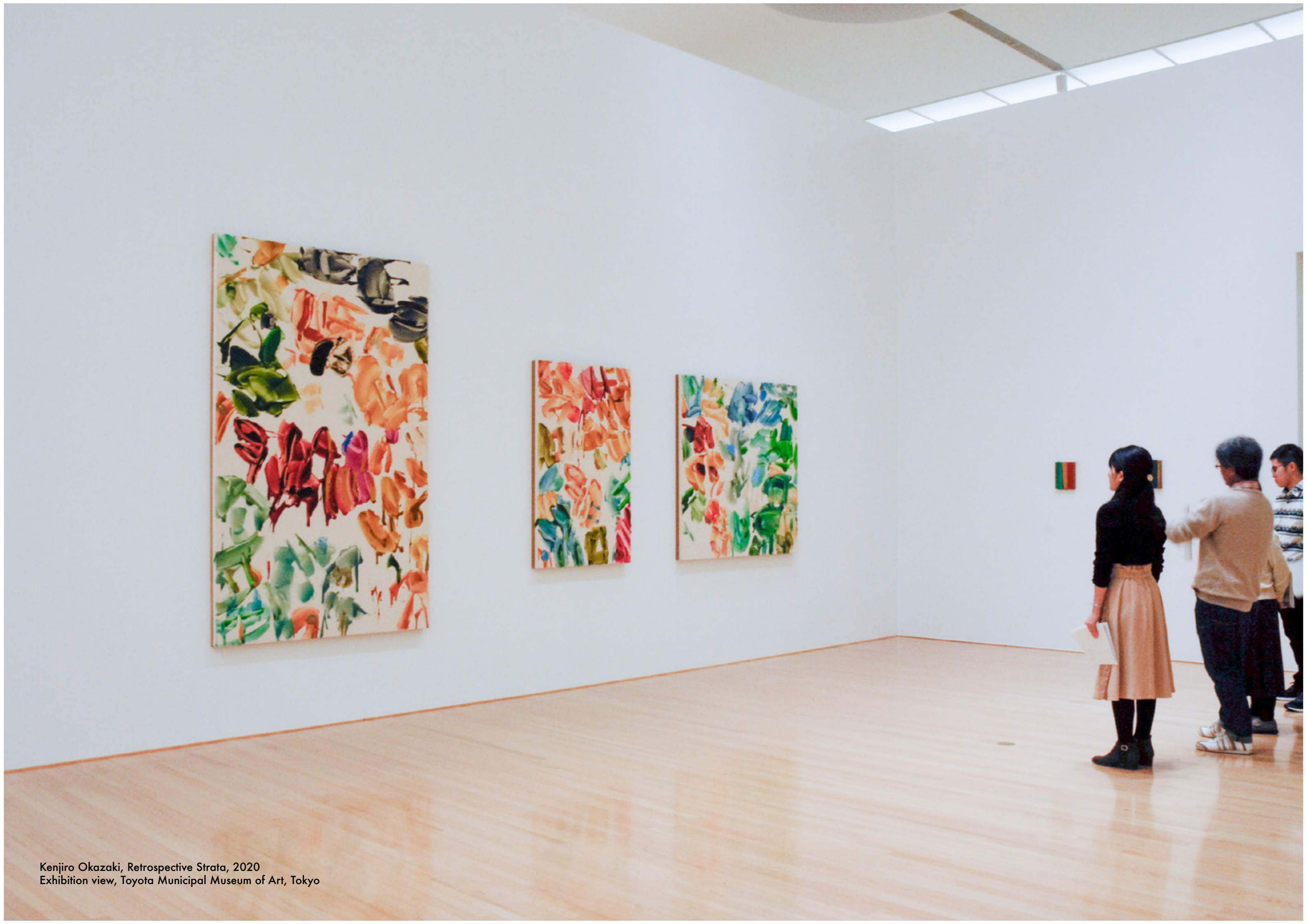
Kenjiro Okazaki, Retrospective Strata, 2020 Exhibition view, Toyota Municipal Museum of Art, Tokyo