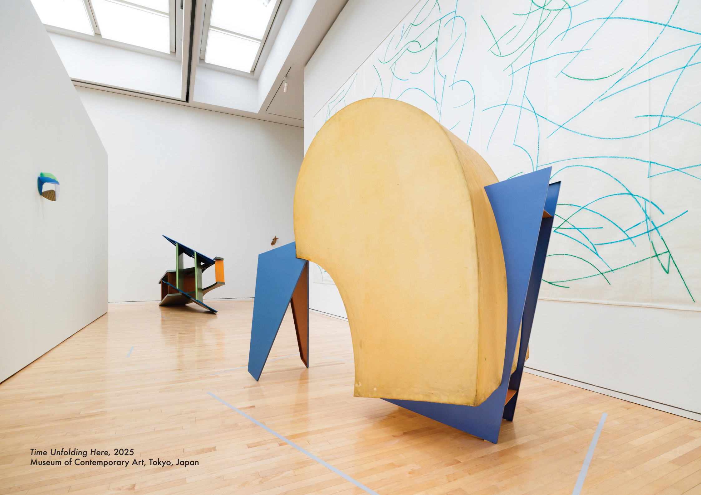
Time Unfolding Here, 2025 Museum of Contemporary Art, Tokyo, Japan