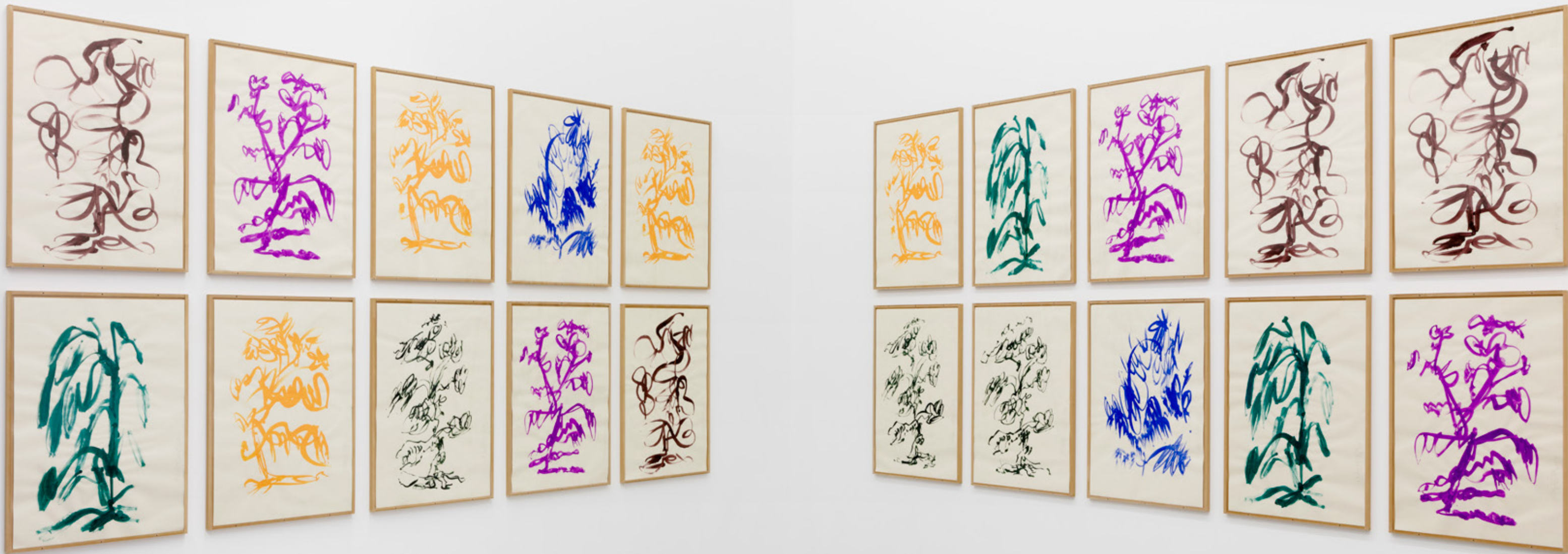
Kenjiro Okazaki, T.A.O.I.N.S.H.R.D.L / COME HEAR AT ONCE, 2019 Acrylic on paper 78 x 54 cm (30 3/4 x 21 1/4 in.) TOPICA PICTUS / Rue de Turenne, 2021 Exhibition view, galerie frank elbaz, Paris