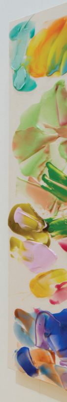
Time Unfolding Here, 2025 Museum of Contemporary Art, Tokyo, Japan