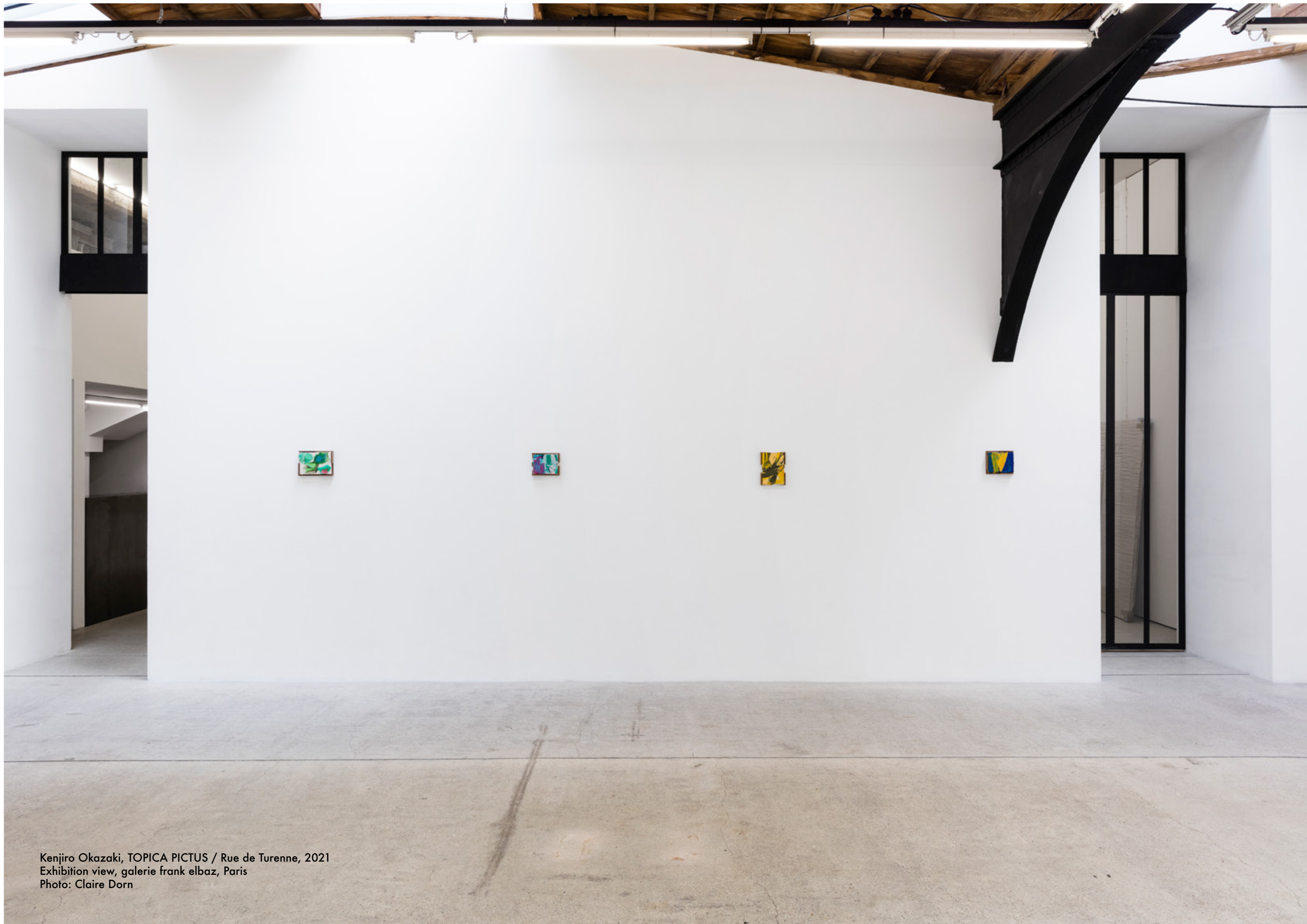
Kenjiro Okazaki, TOPICA PICTUS / Rue de Turenne, 2021 Exhibition view, galerie frank elbaz, Paris