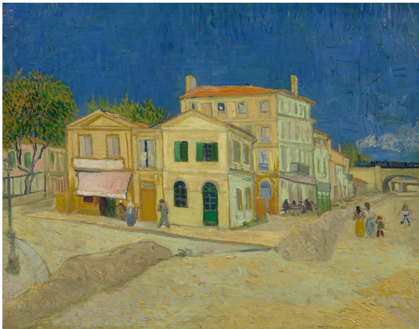
Vincent Van Gogh The Yellow House (The Street) , 1888 Van Gogh Museum, Amsterdam