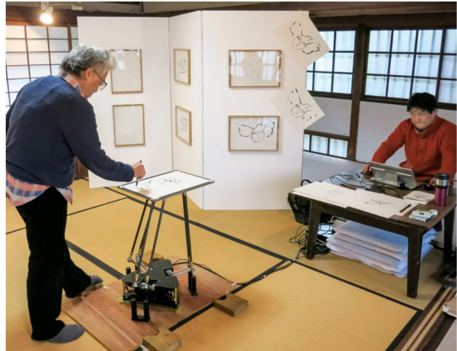
Filmstill from T.T.T.Bot (Turning Table Tripod Robot) , 2015 Collection of the Artist.

These drawings are a collaboration between the artist and his past self, incarnated by the moving drawing board robot. Through this technique a painter can collaborate with past masters, but also with his past self.