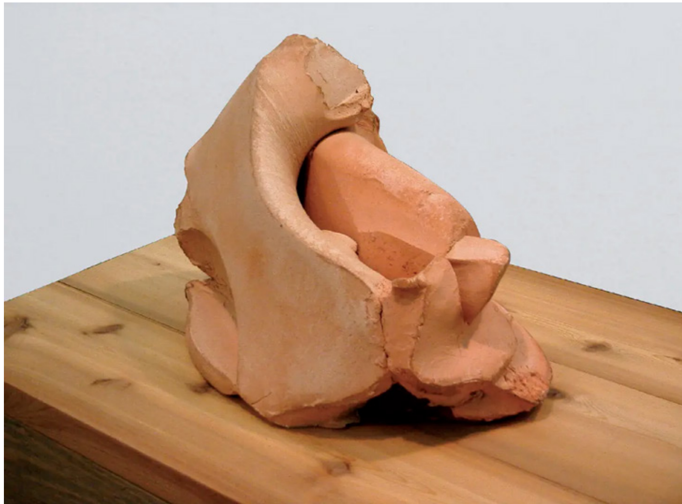
Kenjiro Okazaki Make subservient like SHINFUKU The barbarians of JIUKIYAU, 2000 Ceramic 39,5 × 40.5 × 30 cm