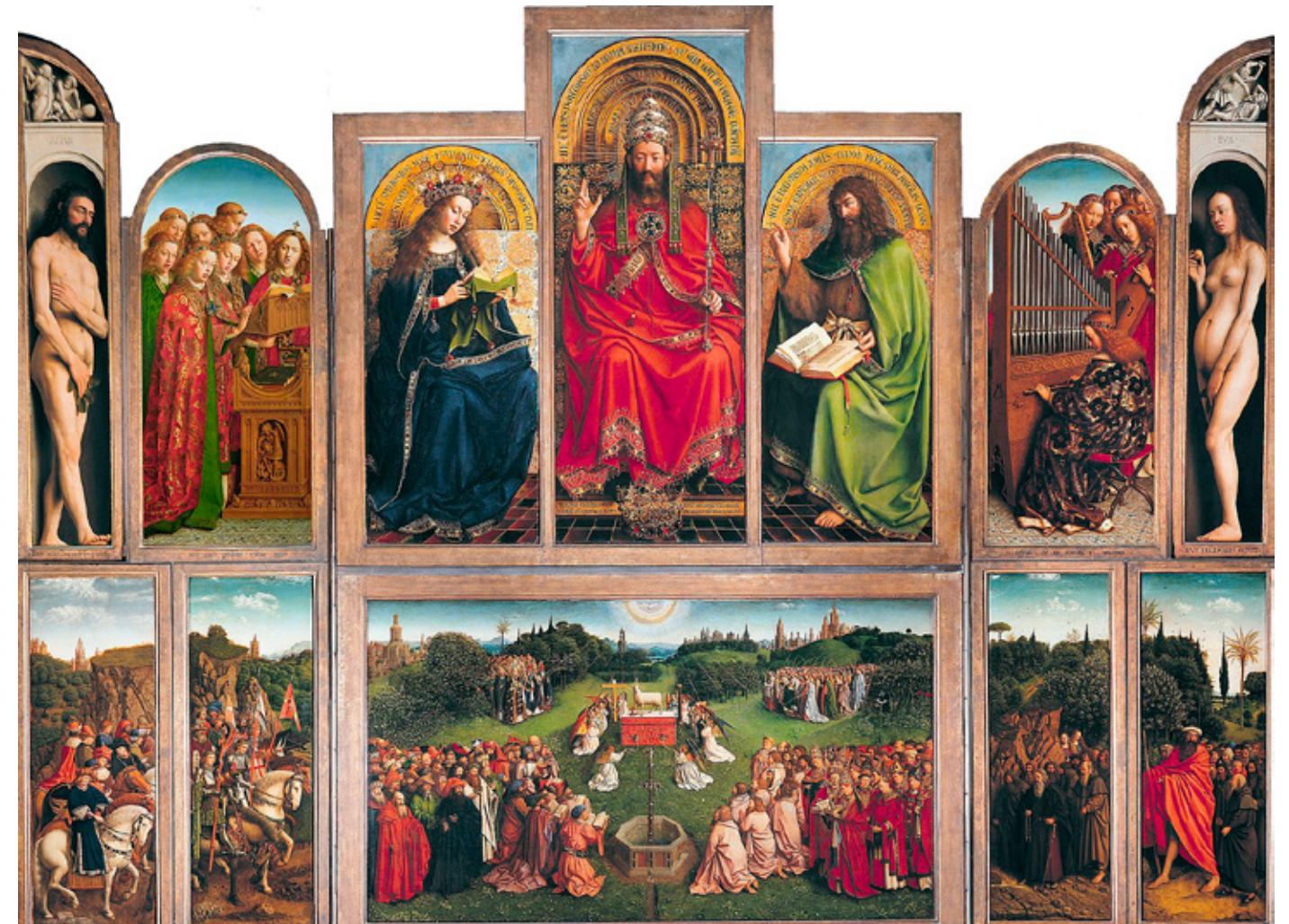
Van Eyck The Adoration of the Mystic Lamb (Ghent Altarpiece) , c1432 Saint Bavo's Cathedral, Ghent, Belgium