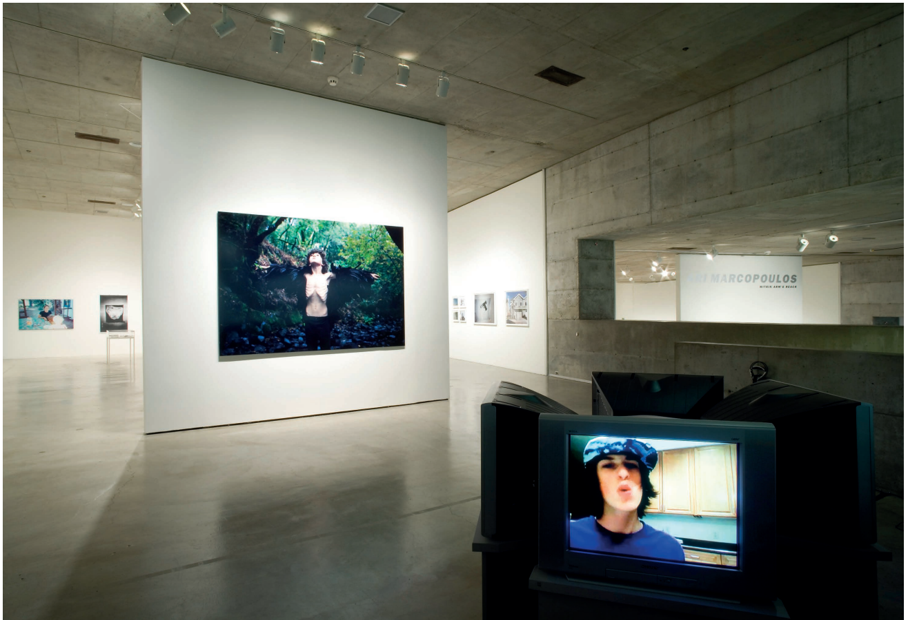
Ari Marcopoulos, Within Arm's Reach , Installation View, Berkeley Art Museum, Berkeley, CA, USA, 2011