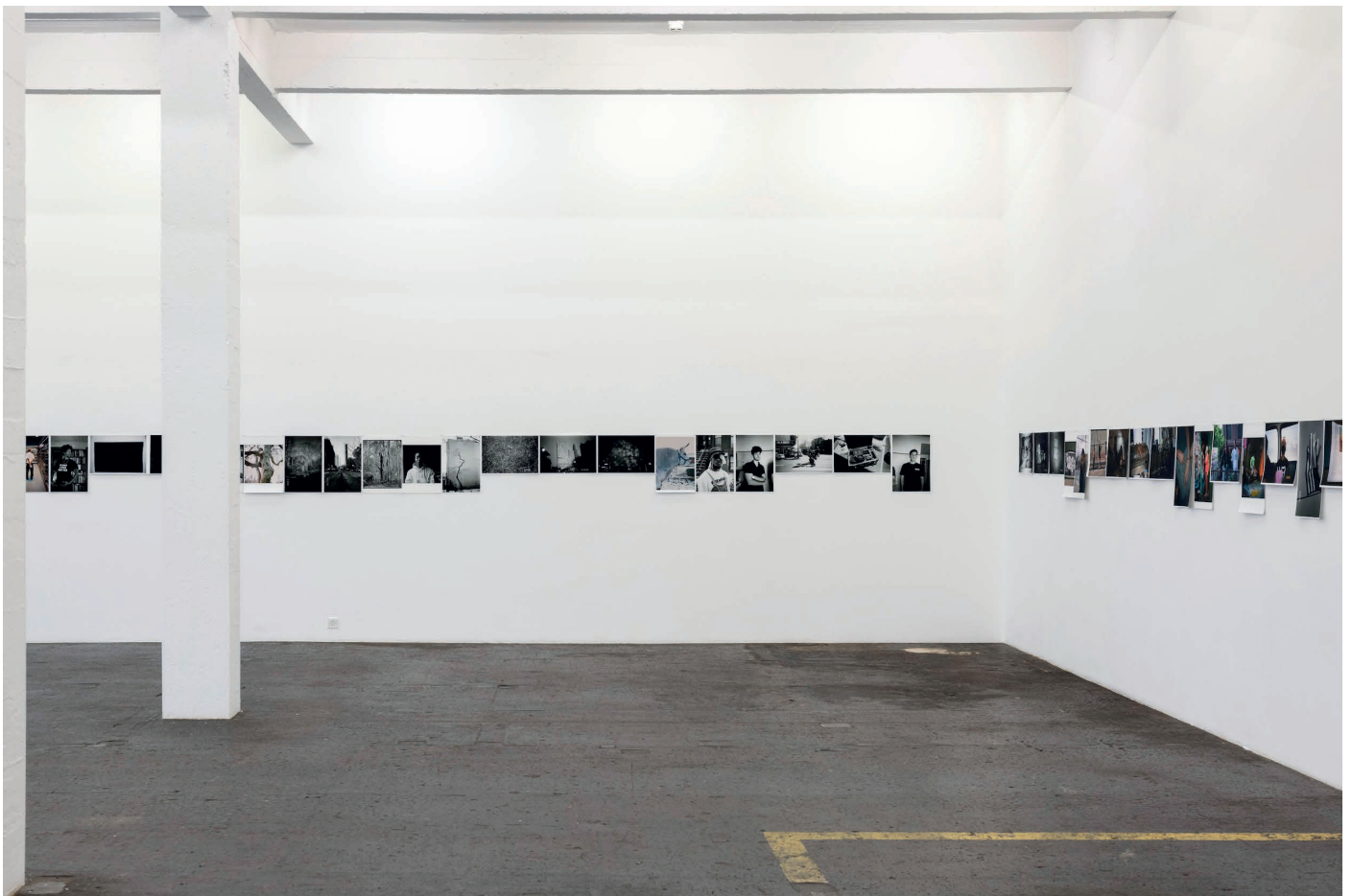
Ari Marcopoulos, Upstream , Installation View, Kunst Halle Sankt Gallen, 2022