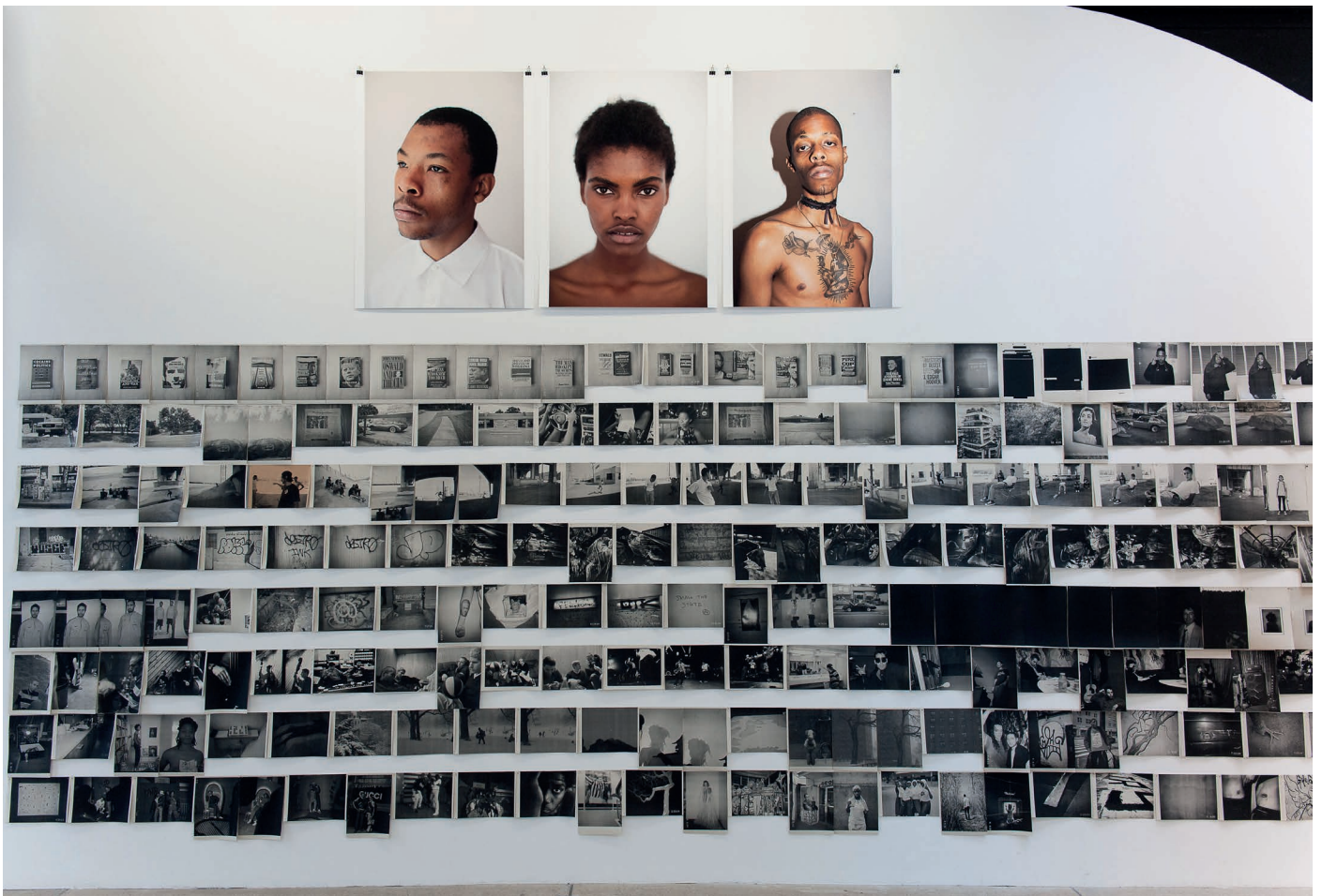
Ari Marcopoulos, Machine , Installation View, galerie frank elbaz, Paris, 2017