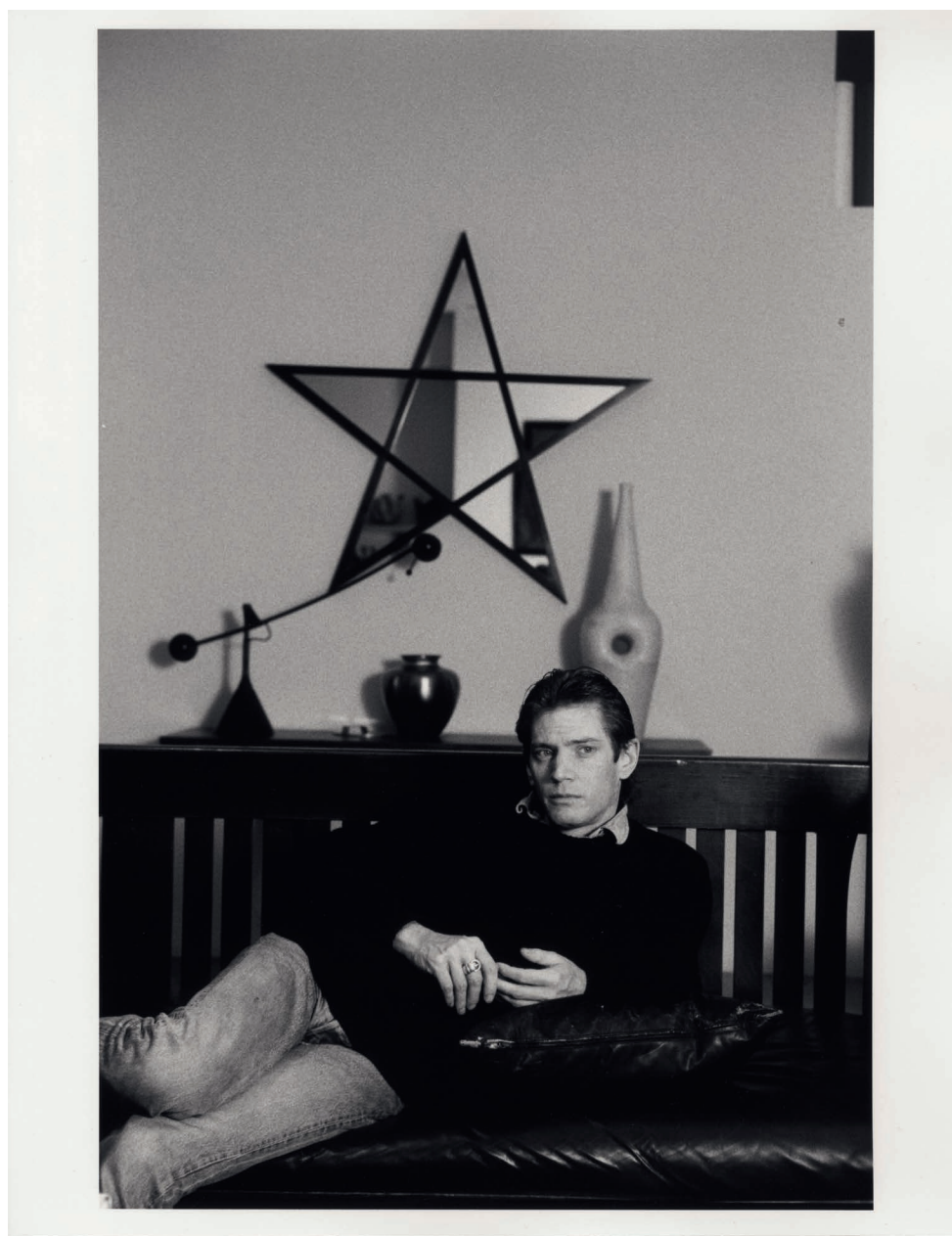
Robert Mapplethorpe, 1986 Vintage silver gelatin print 39,1 x 31,4 cm (15 3/8 x 12 3/8 in.) MAR1986-2386