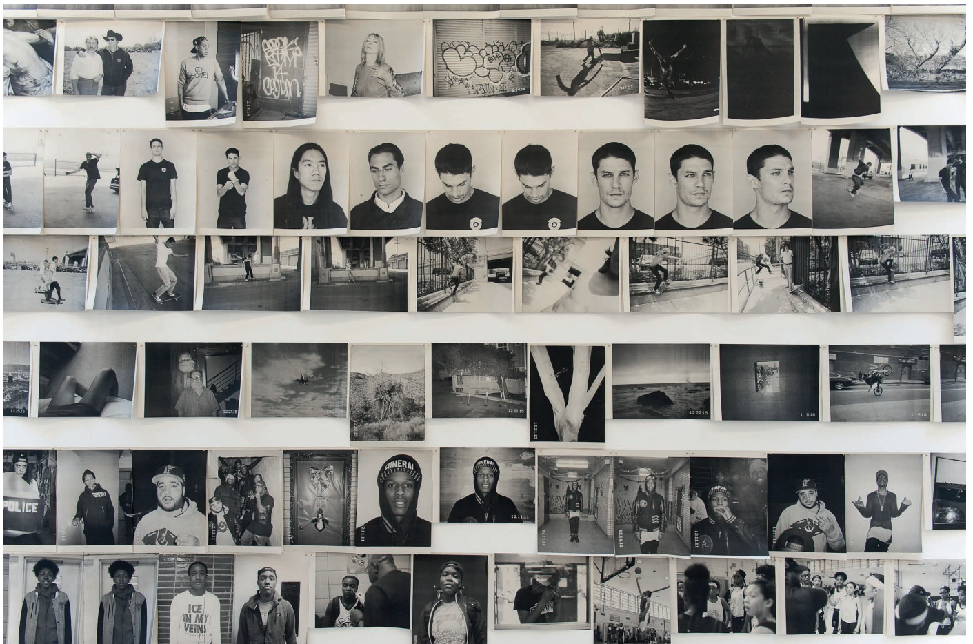
Ari Marcopoulos, Machine , Installation View, galerie frank elbaz, Paris, 2017