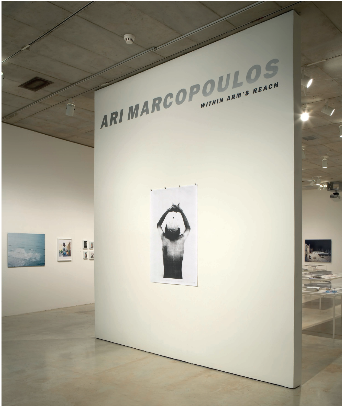
Ari Marcopoulos, Within Arm's Reach , Installation View, Berkeley Art Museum, Berkeley, CA, USA, 2011