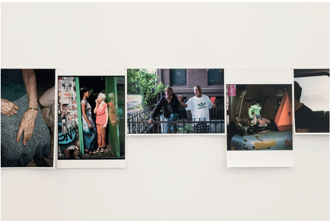
Ari Marcopoulos, Upstream , Installation View, Kunst Halle Sankt Gallen, 2022