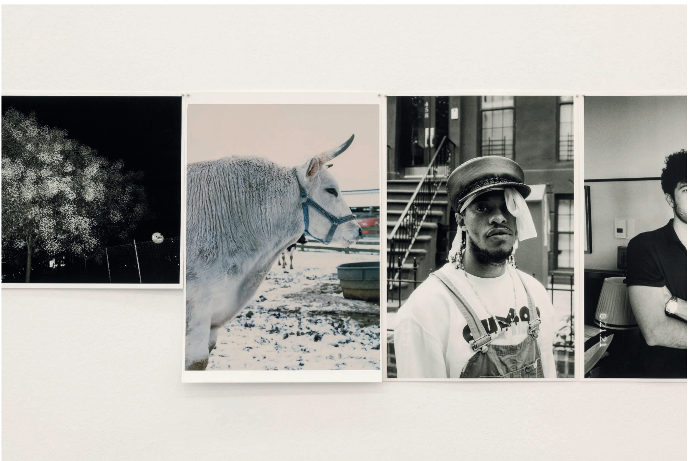
Ari Marcopoulos, Upstream , Installation View, Kunst Halle Sankt Gallen, 2022