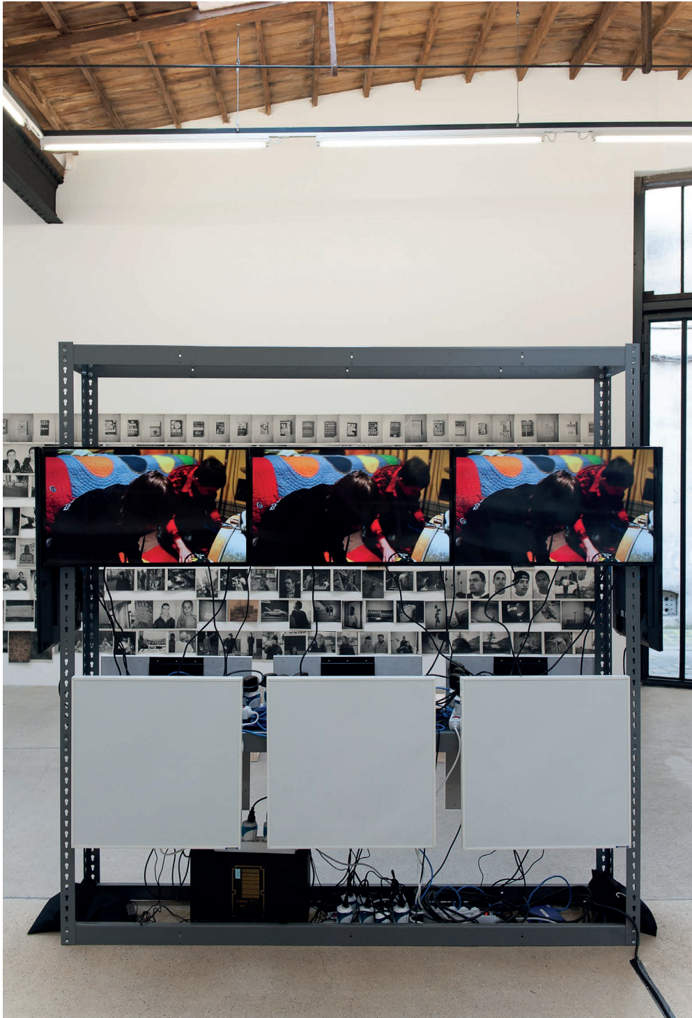
Ari Marcopoulos, Machine , Installation View, galerie frank elbaz, Paris, 2017