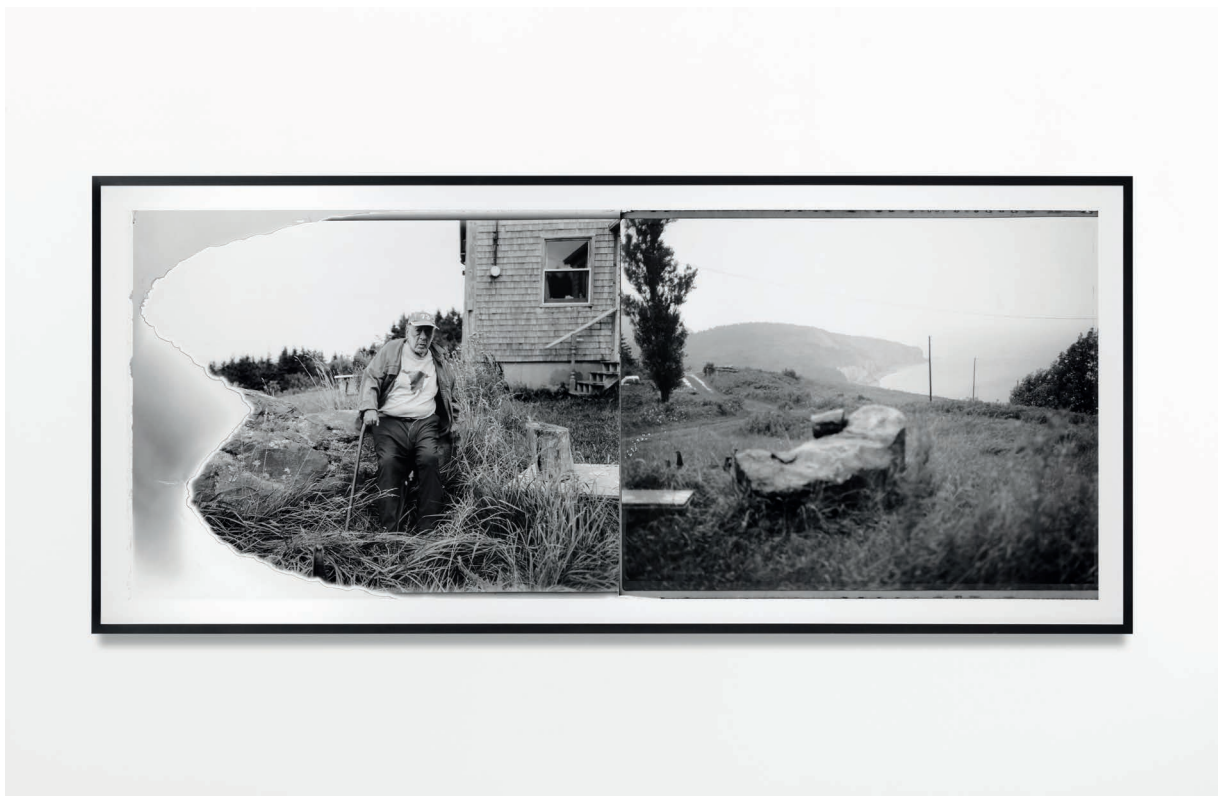
Ari Marcopoulos Robert Frank Diptych , 2018 Silver gelatin type LE/Selenium print 86,4 x 199,4 cm (34 x 78 1/2 in.) Edition 3 + 1 AP MAR2018-2140