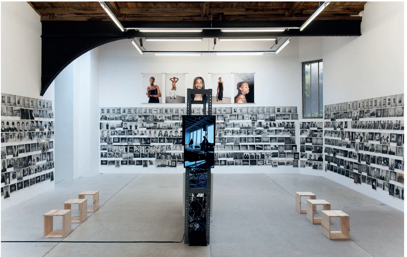
Ari Marcopoulos, Machine , Installation View, galerie frank elbaz, Paris, 2017