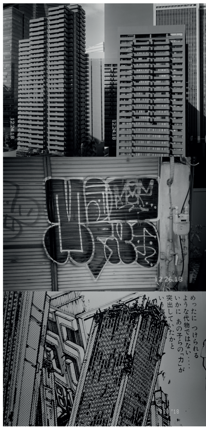
Ari Marcopoulos Tokyo, 2020 Xerox print on paper 190,5 x 91,4 cm (75 x 36 in.) Unique + 1 AP for exhibition purpose (20202421)