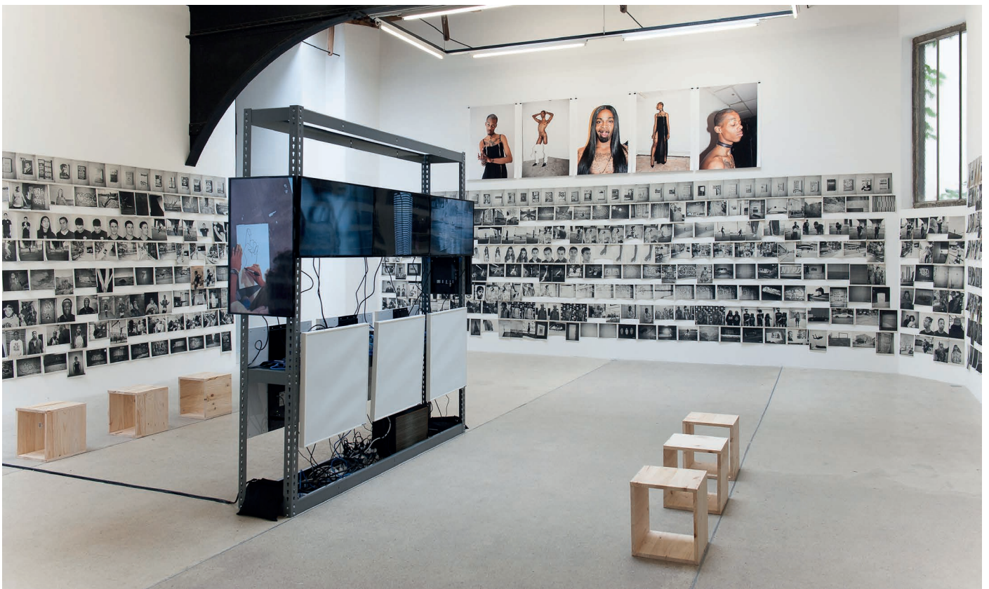
Ari Marcopoulos, Machine , Installation View, galerie frank elbaz, Paris, 2017