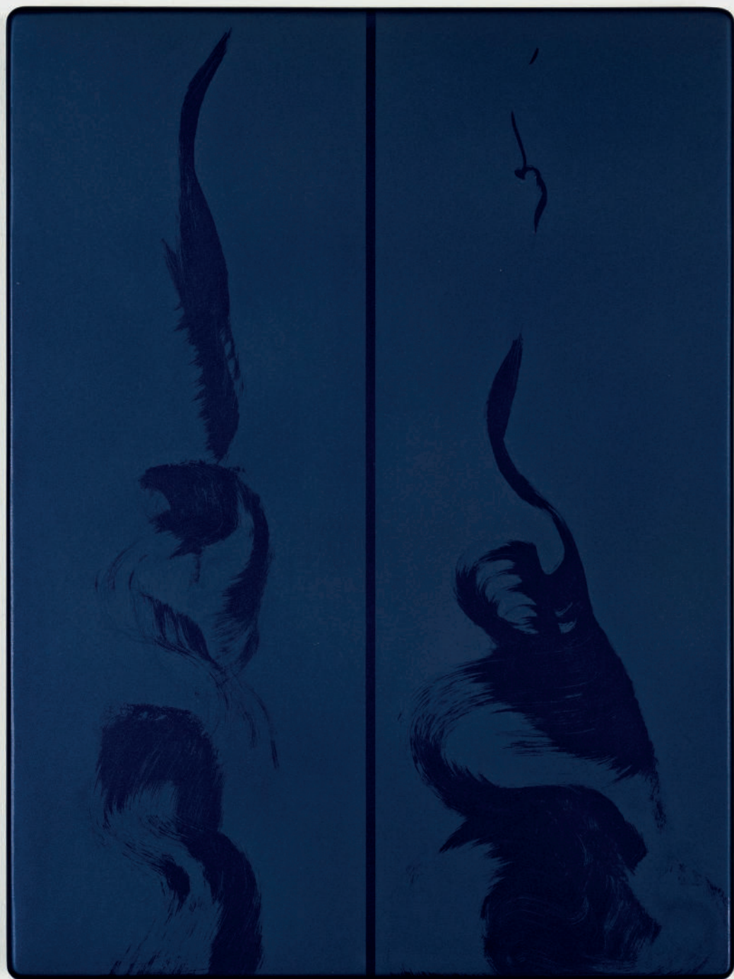
California Calligraphy (Smoke and Mirrors I) , 2023 Acrylic and polyurethane on stretched canvas 61.0 x 46.0 x 5.5 cm Unique