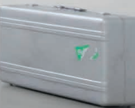
Zeuxis-pop, 2011, Villa du Parc, Centre d'art contemporain, Annemasse