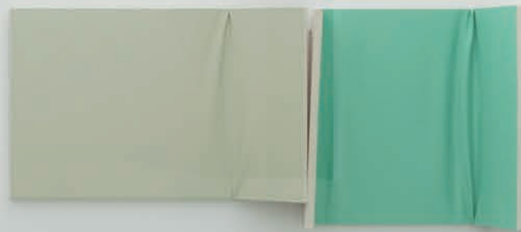
Republic , 2020, Maki Gallery, Tokyo. Exhibition view by Naohiro Utagawa.