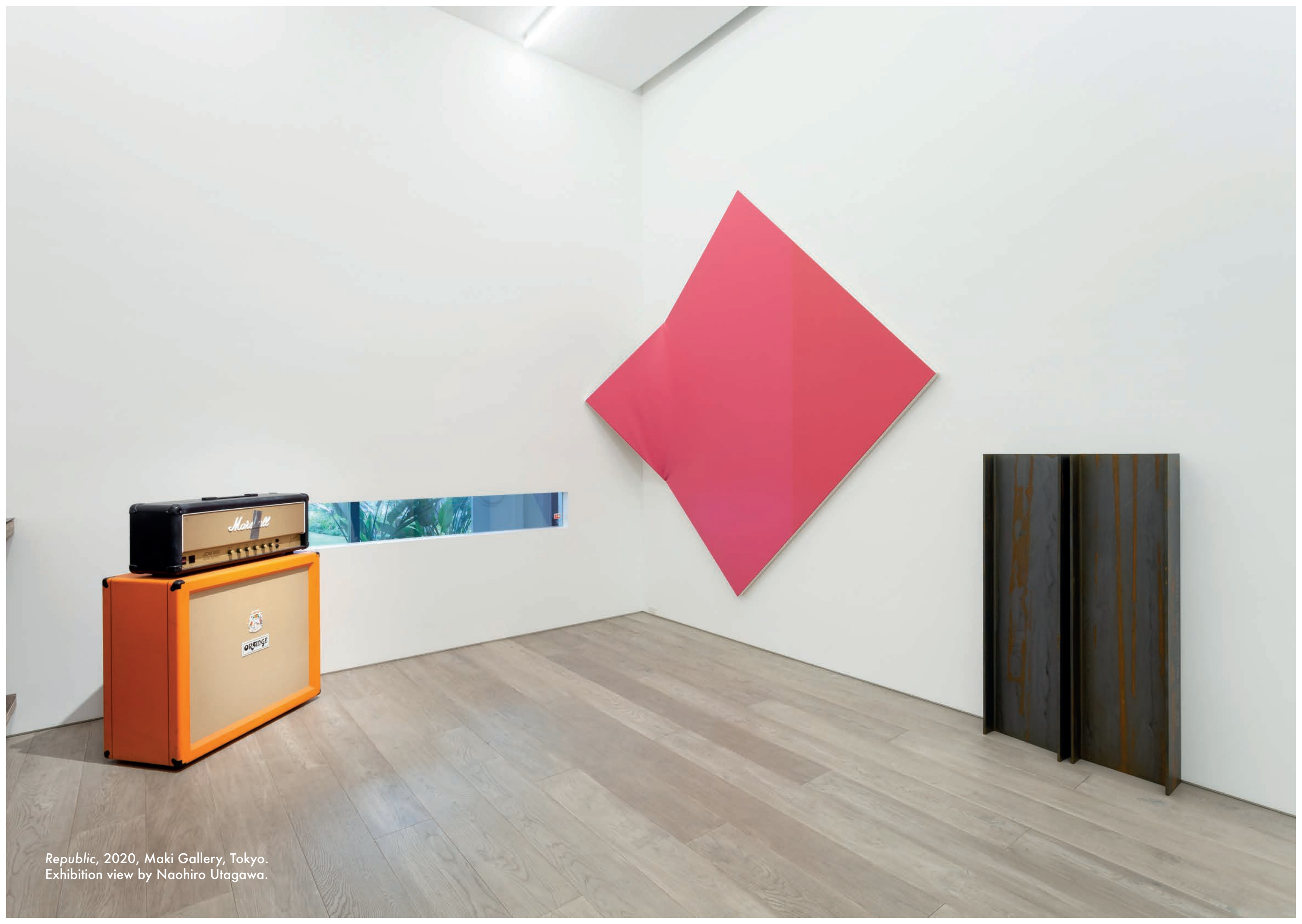
Republic, 2020, Maki Gallery, Tokyo. Exhibition view by Naohiro Utgawa.