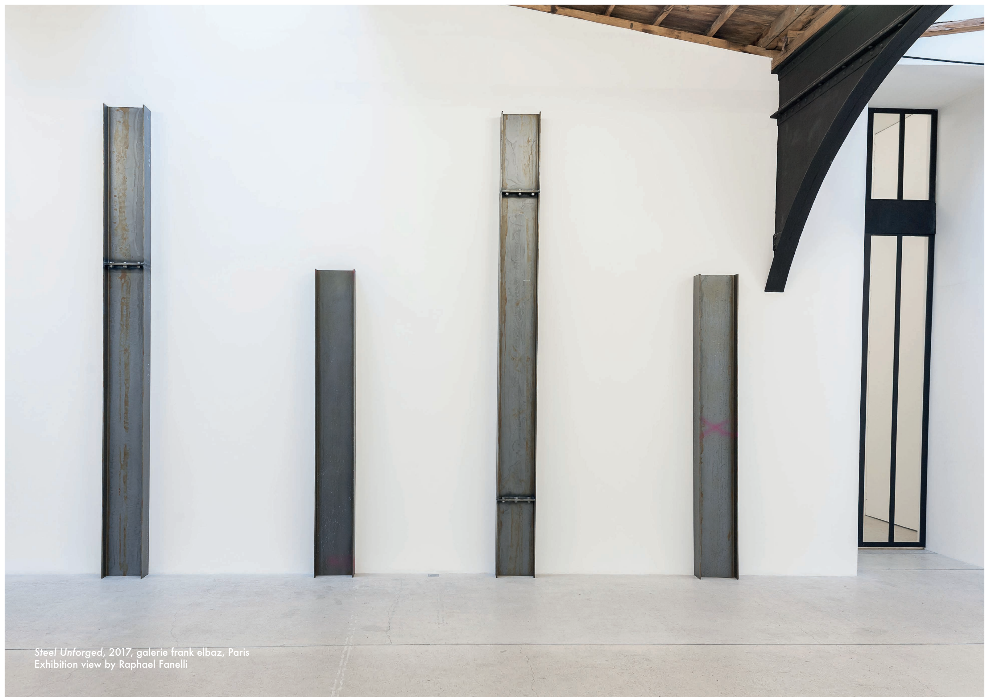
Steel Unforged , 2017, galerie frank elbaz, Paris Exhibition view by Raphael Fanelli