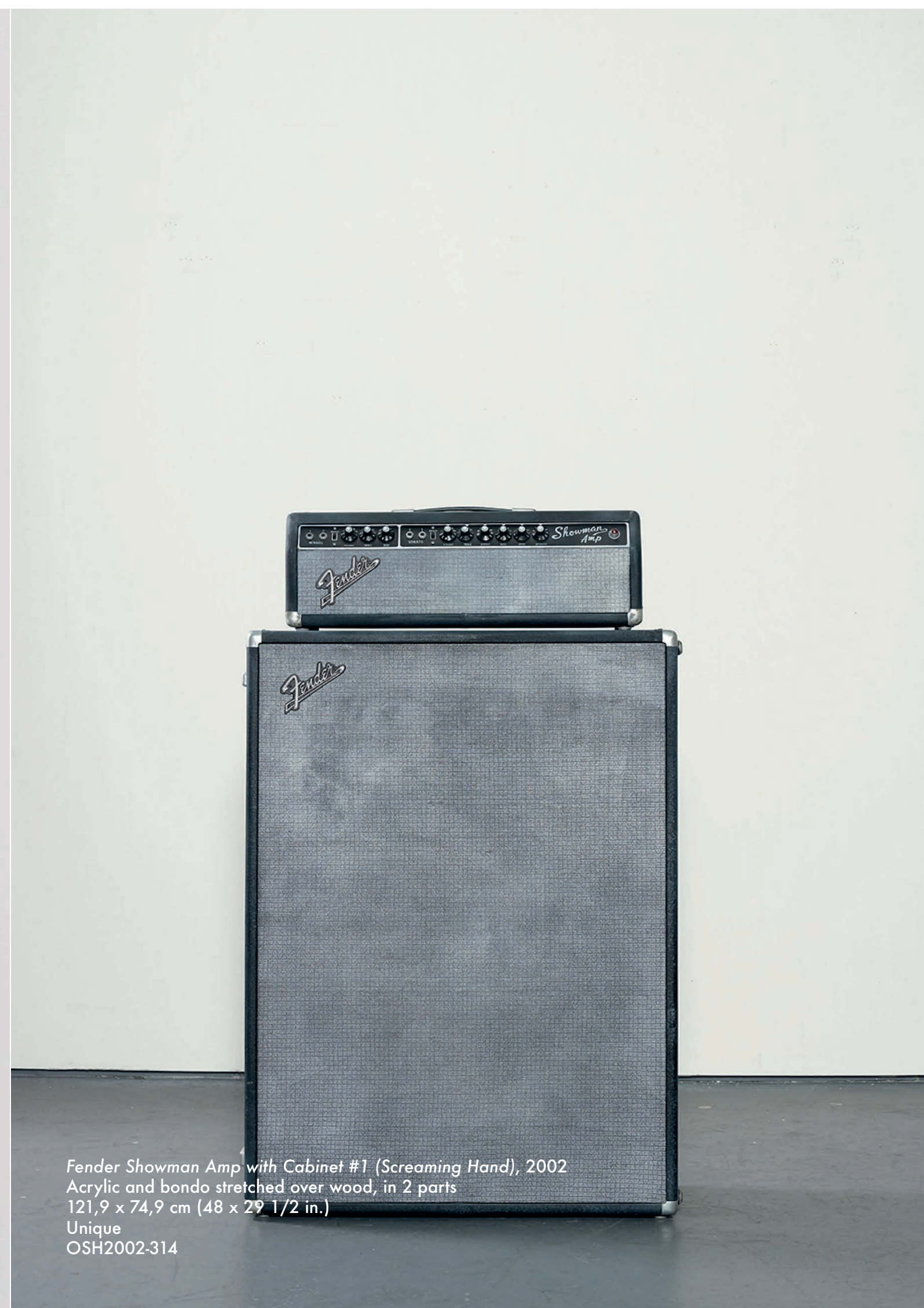
Fender Showman Amp with Cabinet #1 (Screaming Hand), 2002 Acrylic and bondo stretched over wood, in 2 parts 121,9 x 74,9 cm (48 x 29 1/2 in.) Unique OSH2002-314