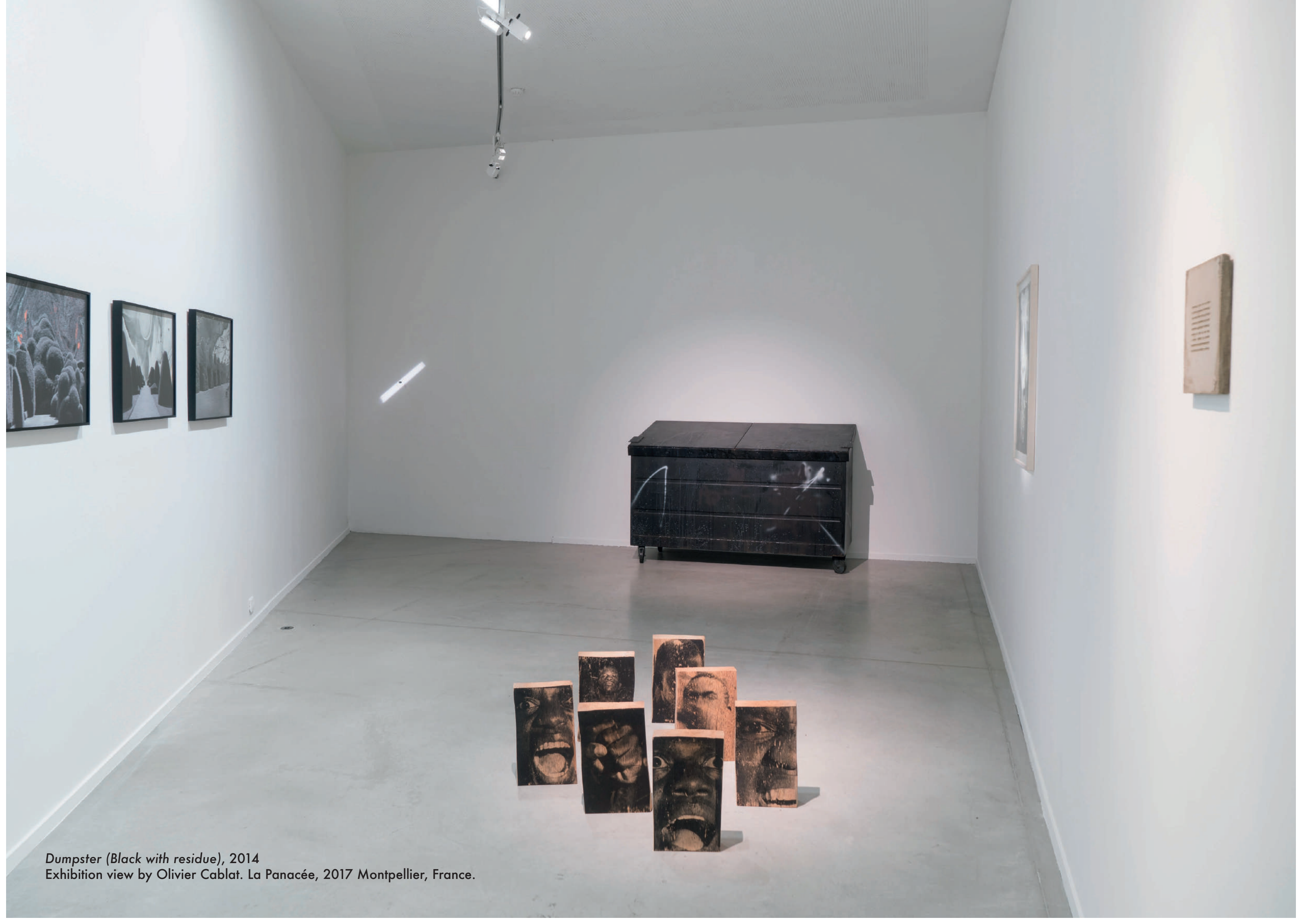
Dumpster (Black with residue), 2014 Exhibition view by Olivier Cablat. La Panacée, 2017 Montpellier, France.