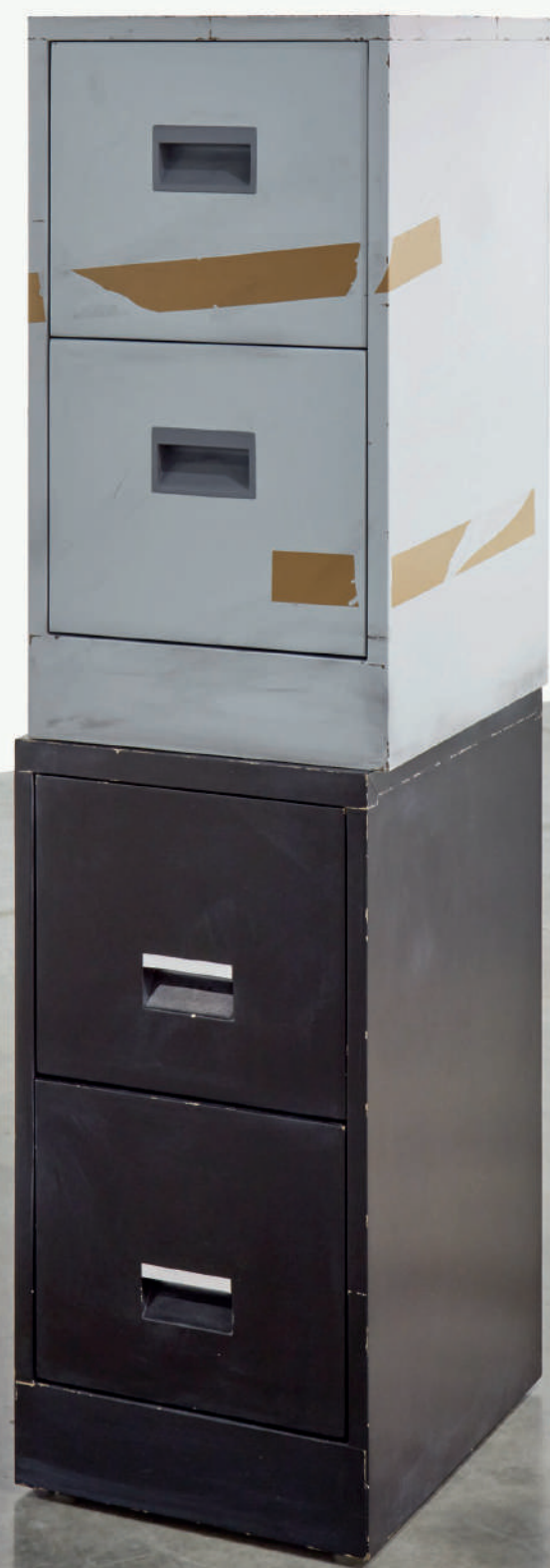
File Cabinets, 2012 Acrylic and Bondo on stretched canvas 145,4 x 39,4 x 46,4 cm (57 1/4 x 15 1/2 x 18 1/4 in.) Unique OSH2012-2569