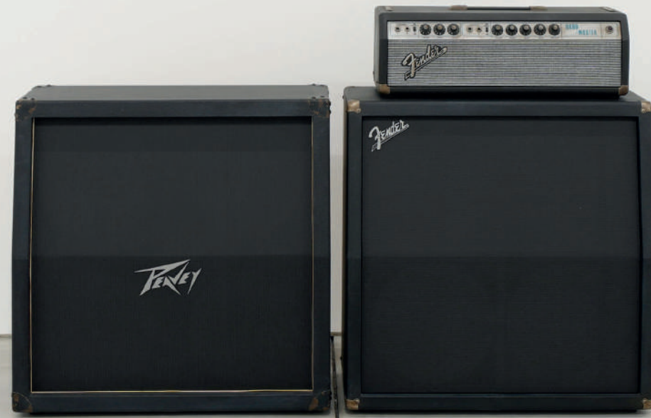
Nothing New Under the Sun, 2023, MAKI Gallery