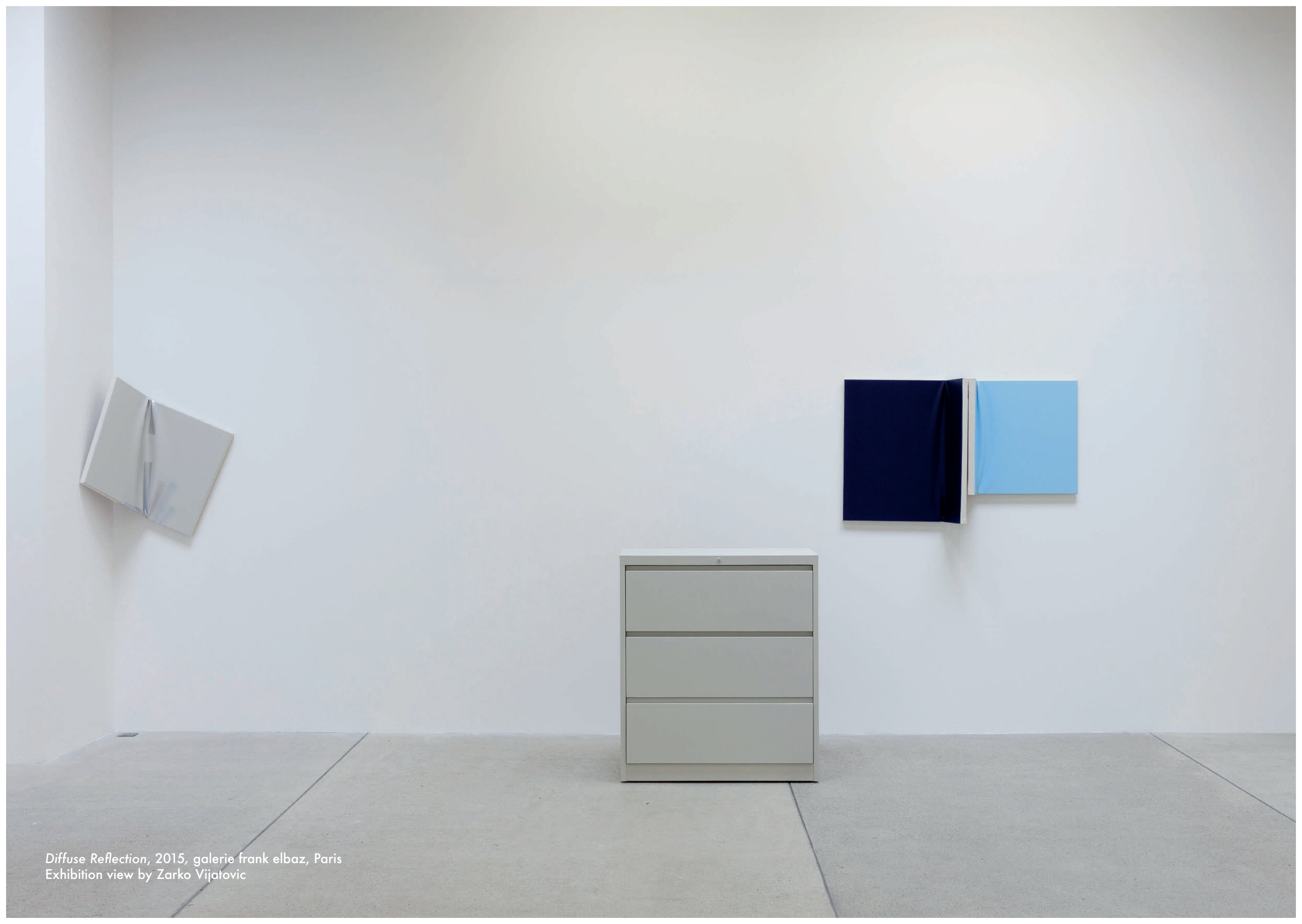
Diffuse Reflection , 2015, galerie frank elbaz, Paris Exhibition view