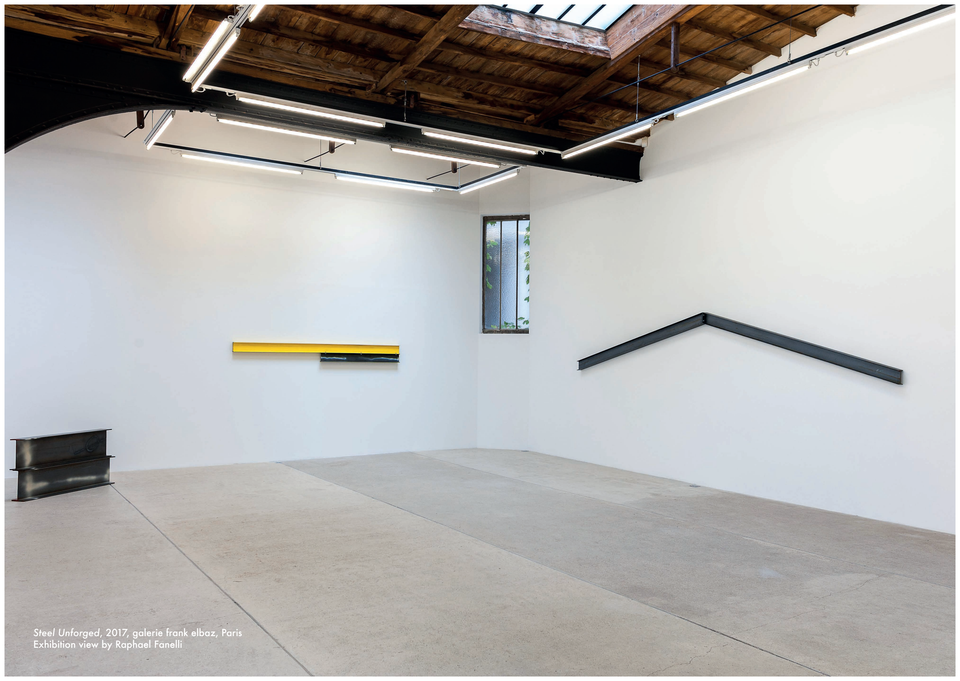
Steel Unforged , 2017, galerie frank elbaz, Paris Exhibition view