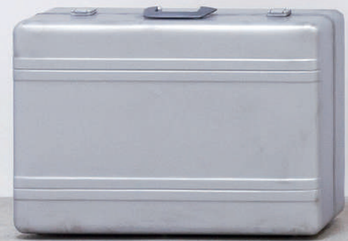
Diffuse Reflection , 2015, galerie frank elbaz, Paris Exhibition view