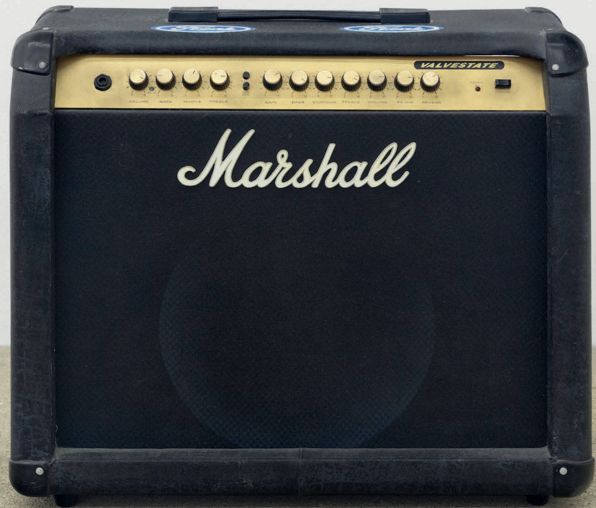
Marshall Amp (Freak), 2000 Acrylic and bondo stretched canvas 47 x 54,6 x 24,1 cm (18 1/2 x 21 1/2 x 9 1/2 in.) Unique OSH20002-455