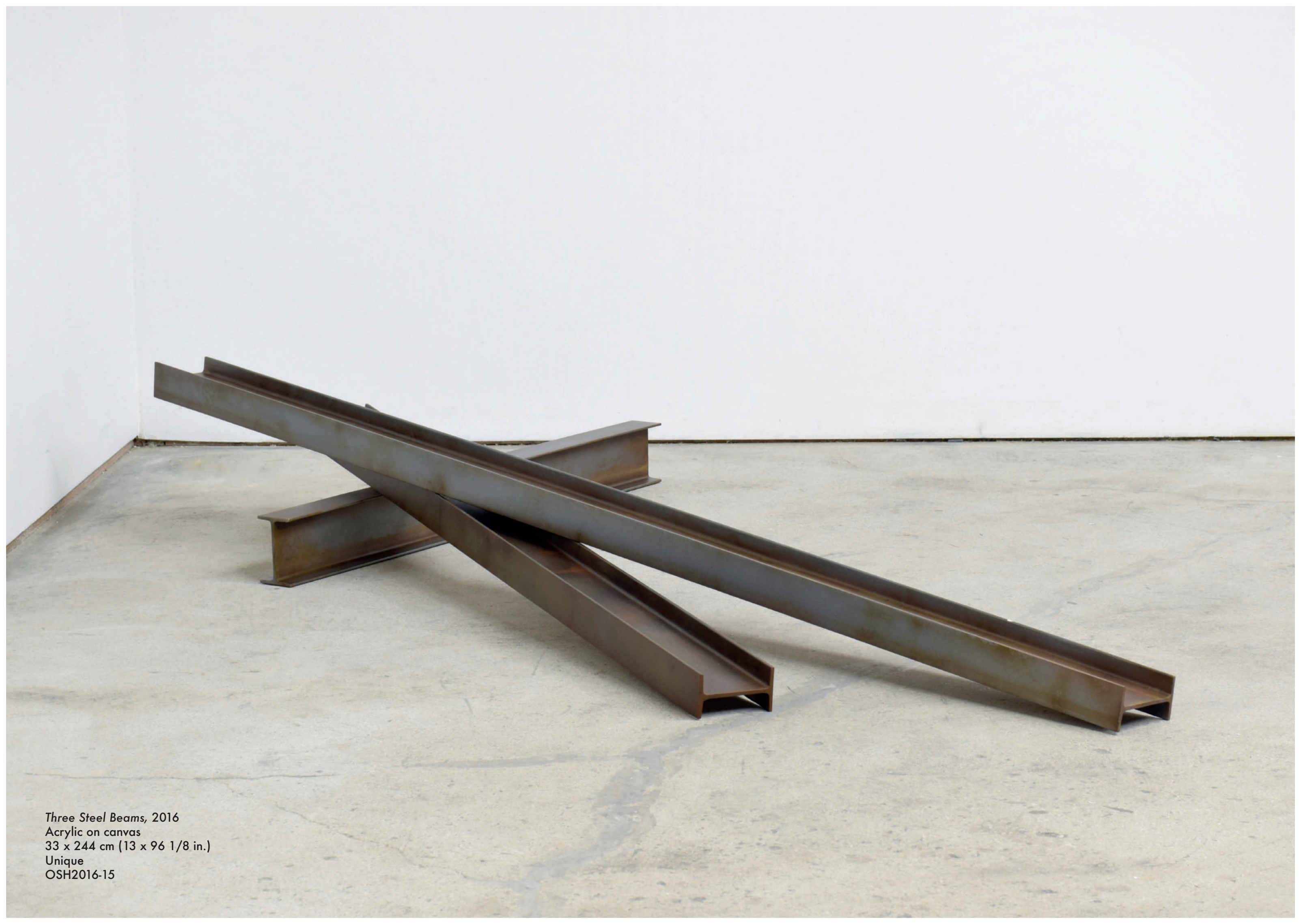
Three Steel Beams , 2016 Acrylic on canvas 33 x 244 cm (13 x 96 1/8 in.) Unique OSH2016-15