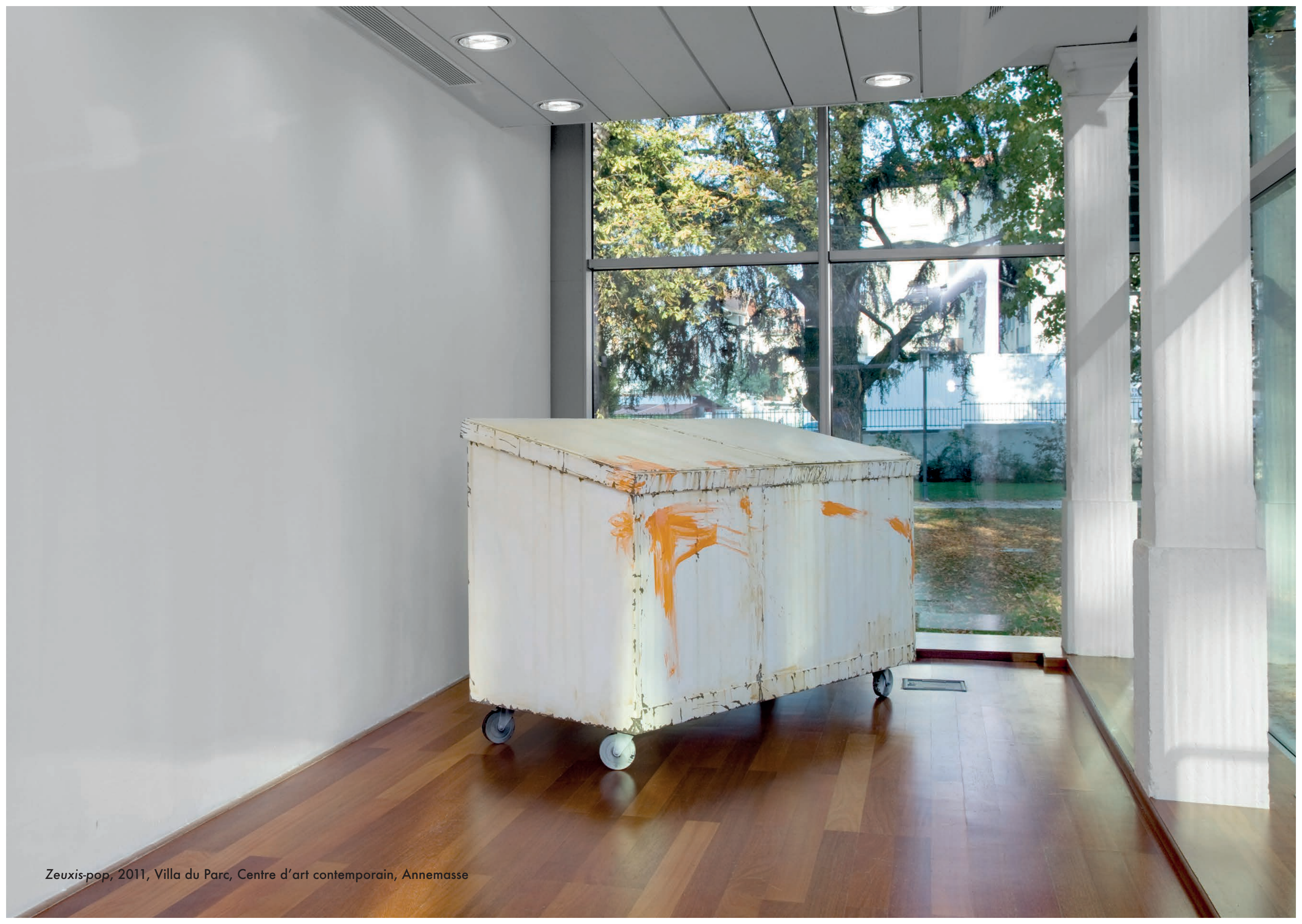
Zeuxis-pop, 2011, Villa du Parc, Centre d'art contemporain, Annemasse