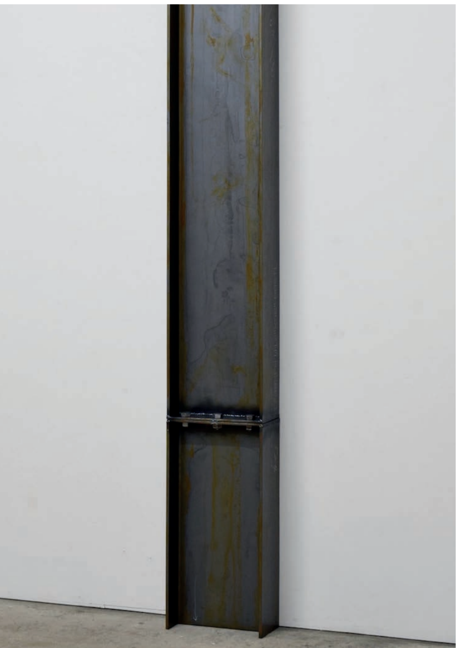
Untitled (Steel Beam) , 2017 Acrylic and Bondo on canvas 367,5 x 35 x 15,4 cm (144 5/8 x 13 3/4 x 6 1/8 in.) Unique OSH2017-1252