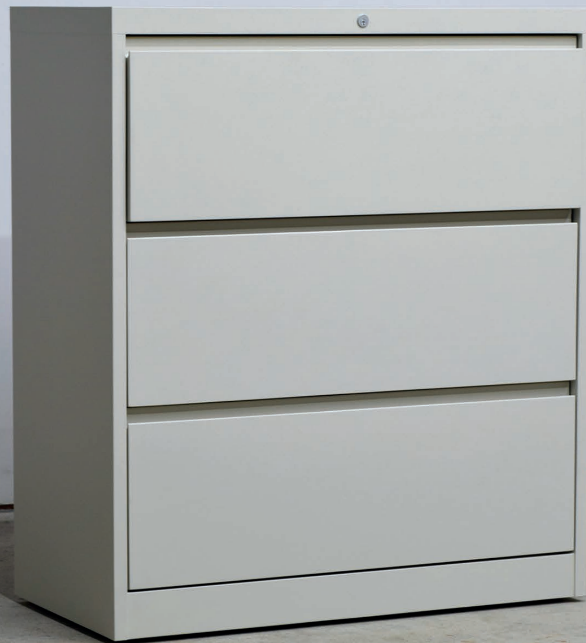
Lateral File Cabinet (Almond #2), 2015 Acrylic and Bondo on stretched canvas 105,4 x 91,4 cm (41 1/2 x 36 in.) Unique OSH2015-738