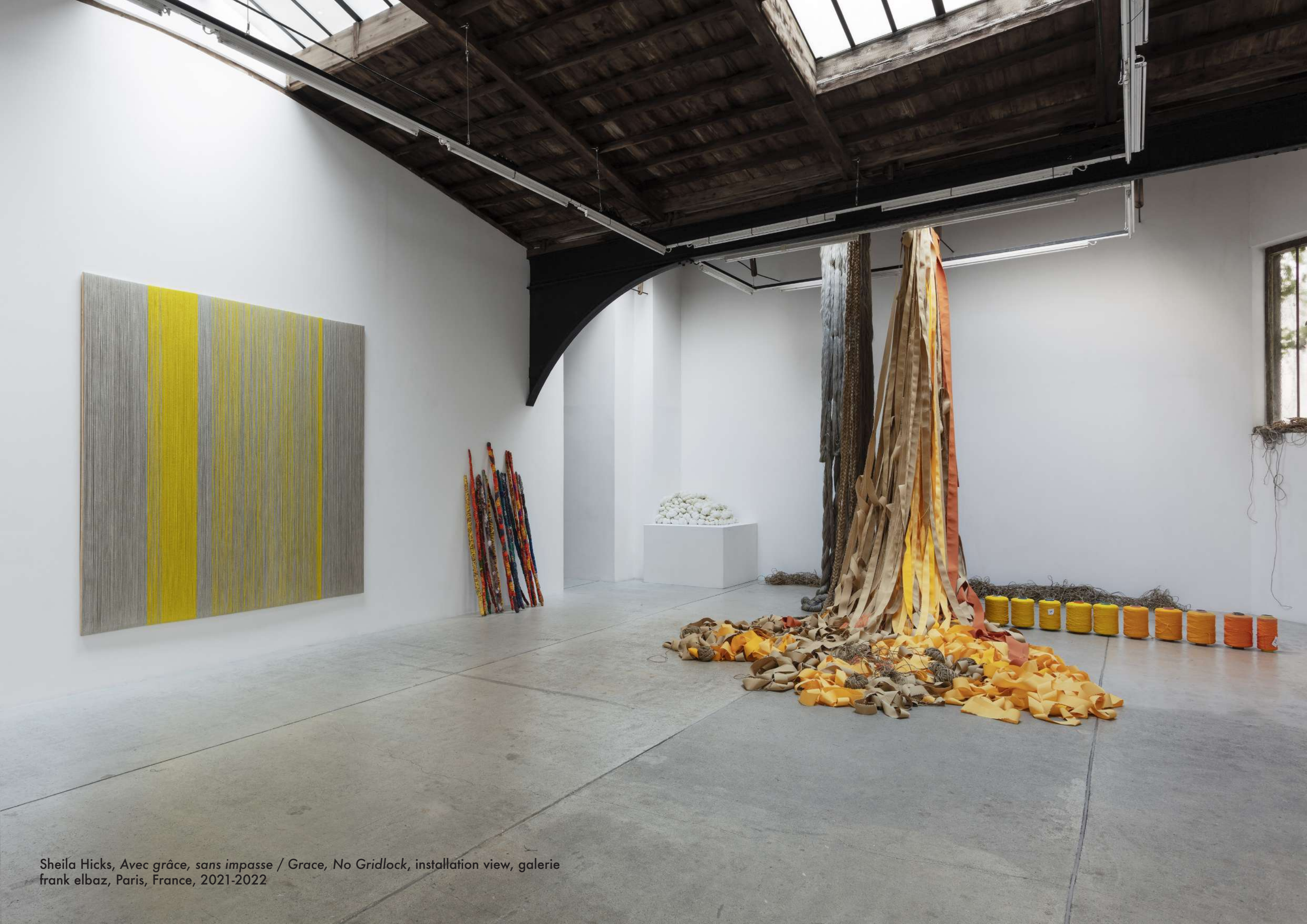
Sheila Hicks, Avec grâce, sans impasse / Grace, No Gridlock , installation view, galerie frank elbaz, Paris, France, 2021-2022