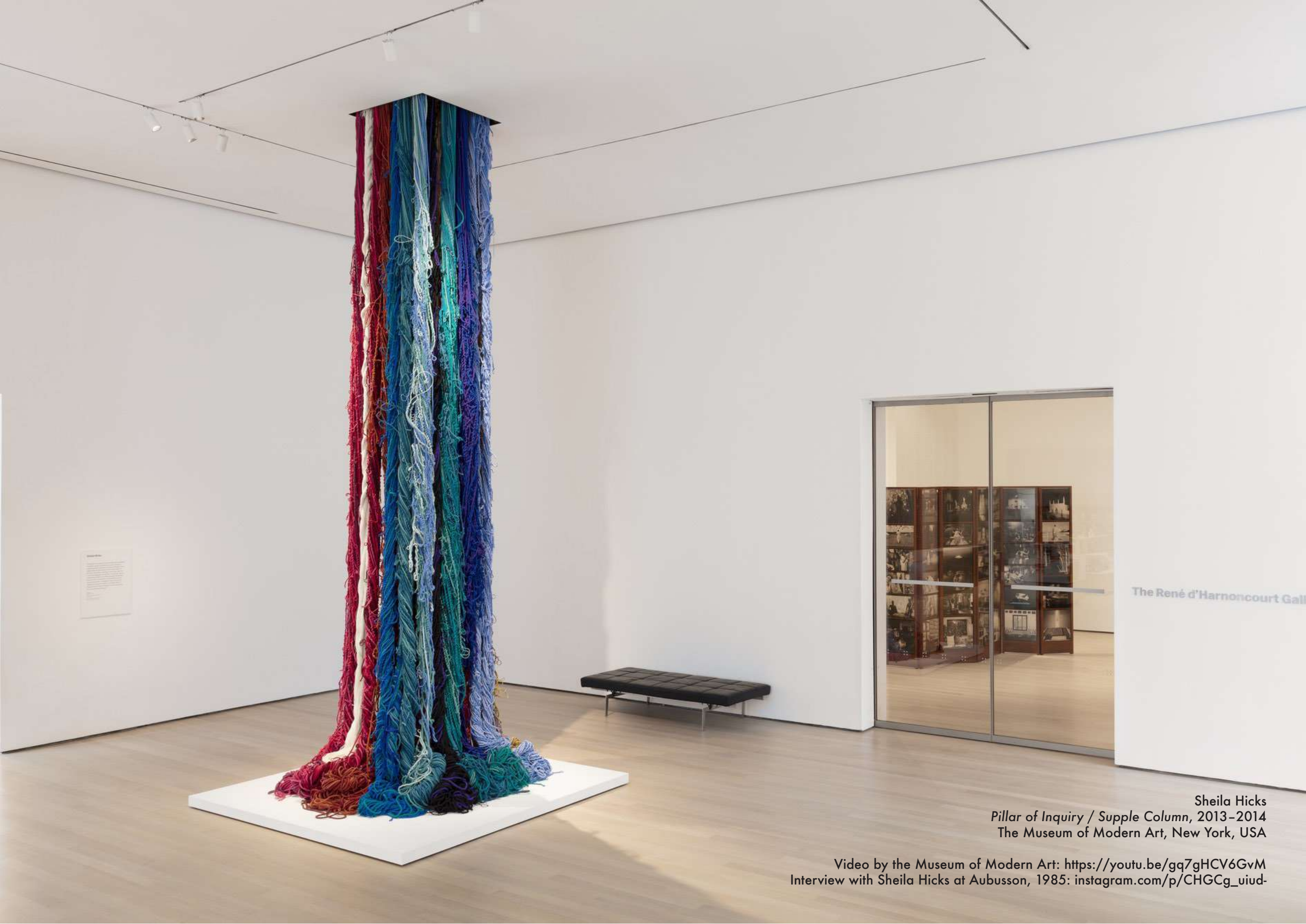
Sheila Hicks Pillar of Inquiry / Supple Column , 2013–2014 The Museum of Modern Art, New York, USA

Video by the Museum of Modern Art: https://youtu.be/gq7gHCV6GvM Interview with Sheila Hicks at Aubusson, 1985: instagram.com/p/CHGCg_uiud-