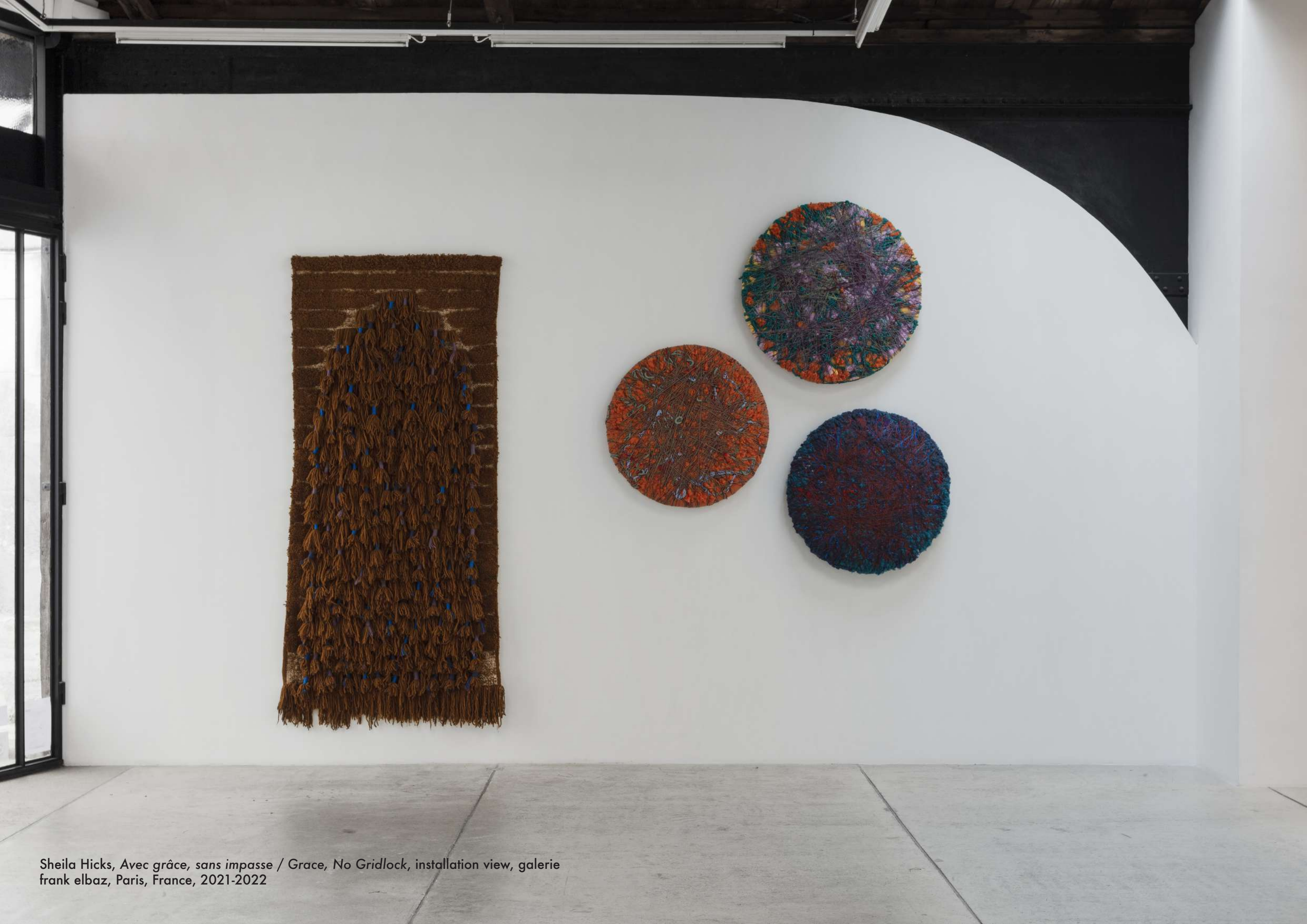
Sheila Hicks, Avec grâce, sans impasse / Grace, No Gridlock , installation view, galerie frank elbaz, Paris, France, 2021-2022