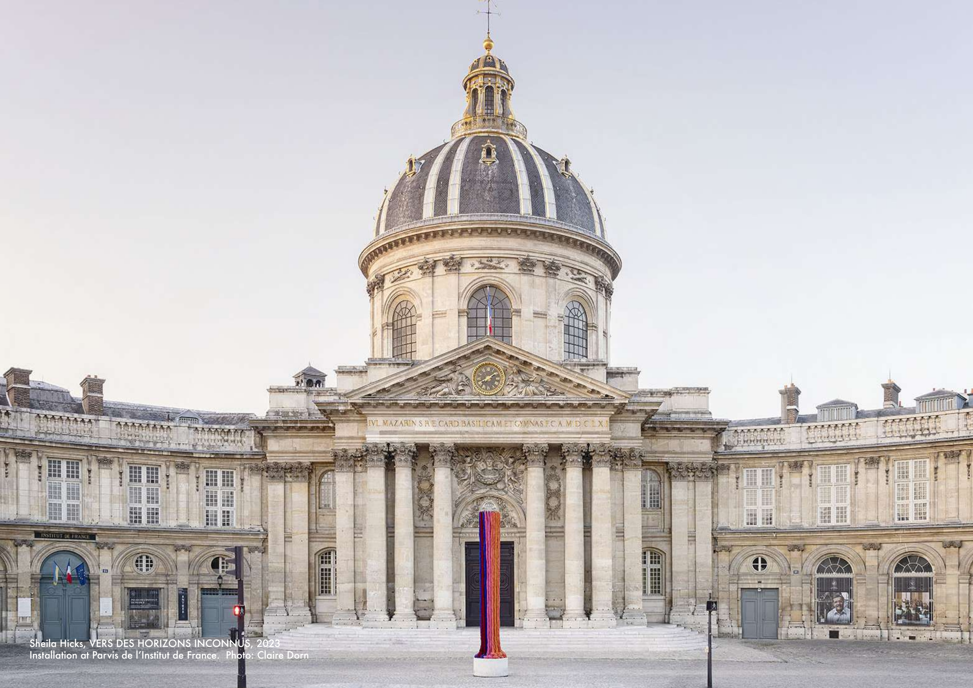
Sheila Hicks, VERS DES HORIZONS INCONNUS, 2023 Installation at Parvis de l'Institut de France.