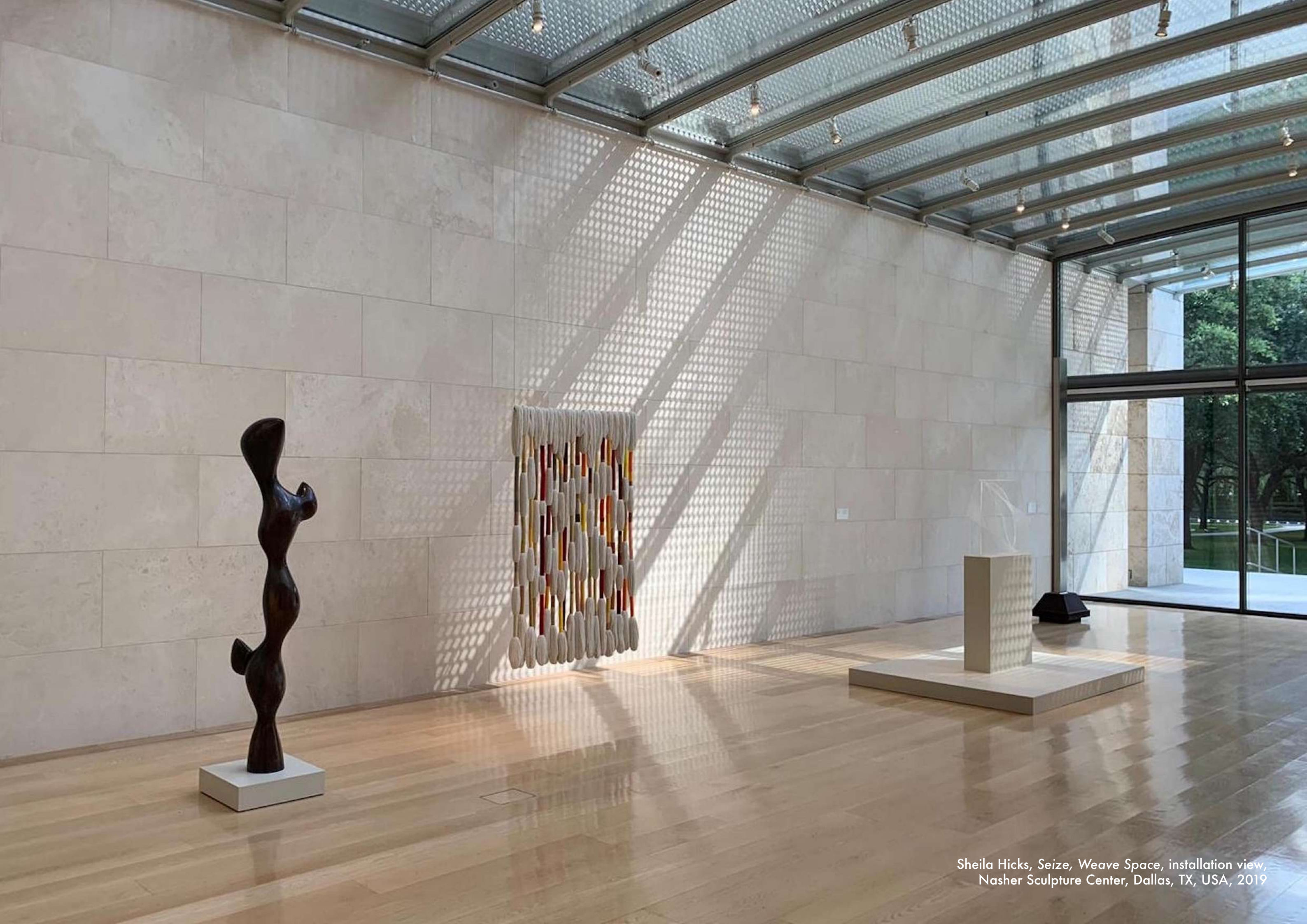
Sheila Hicks, Seize Weave Space , installation view, Nasher Sculpture Center, Dallas, TX, USA, 2019