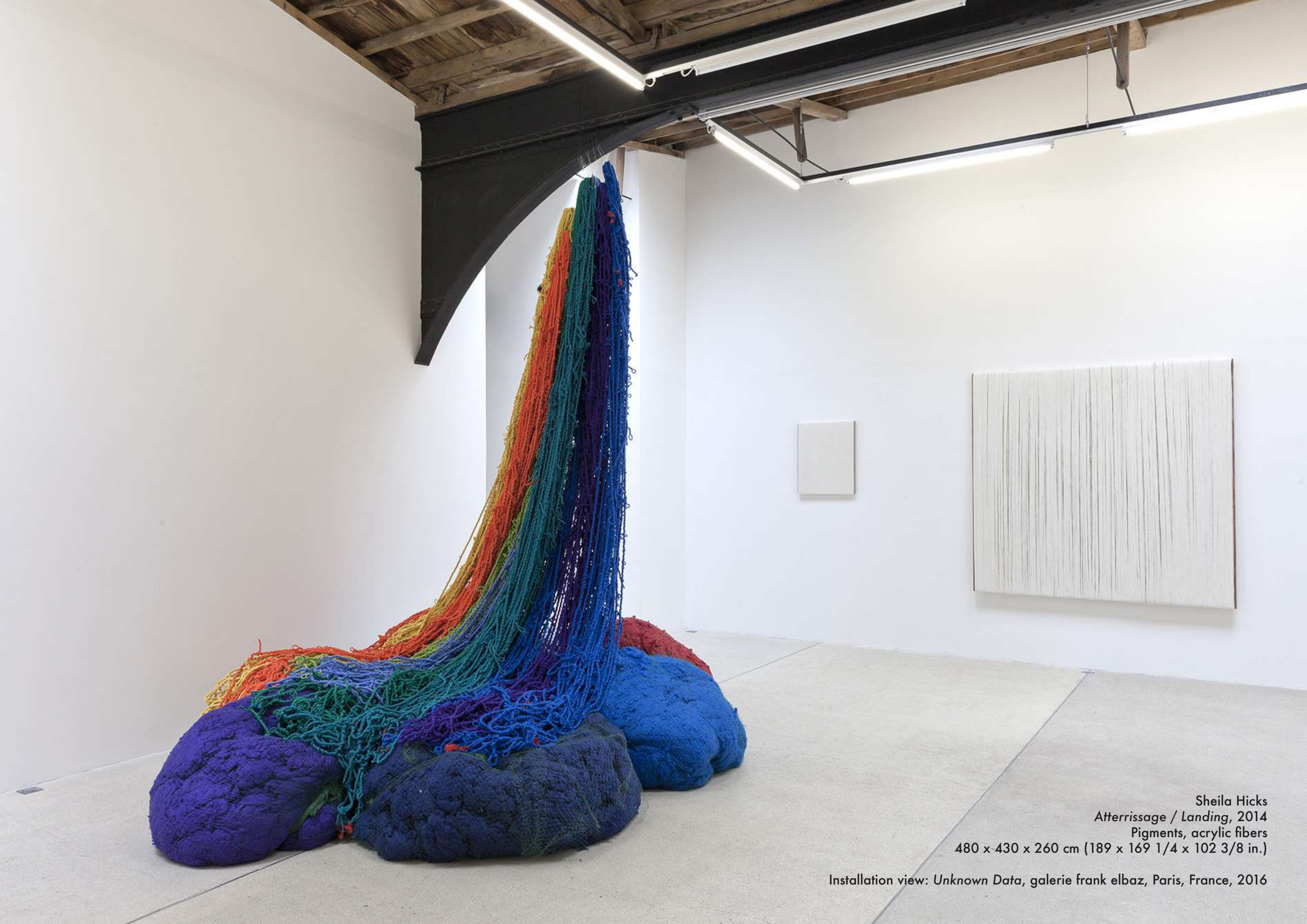
Sheila Hicks Atterrissage / Landing , 2014 Pigments, acrylic fibers 480 x 430 x 260 cm (189 x 169 1/4 x 102 3/8 in.)

Installation view: Unknown Data , galerie frank elbaz, Paris, France, 2016