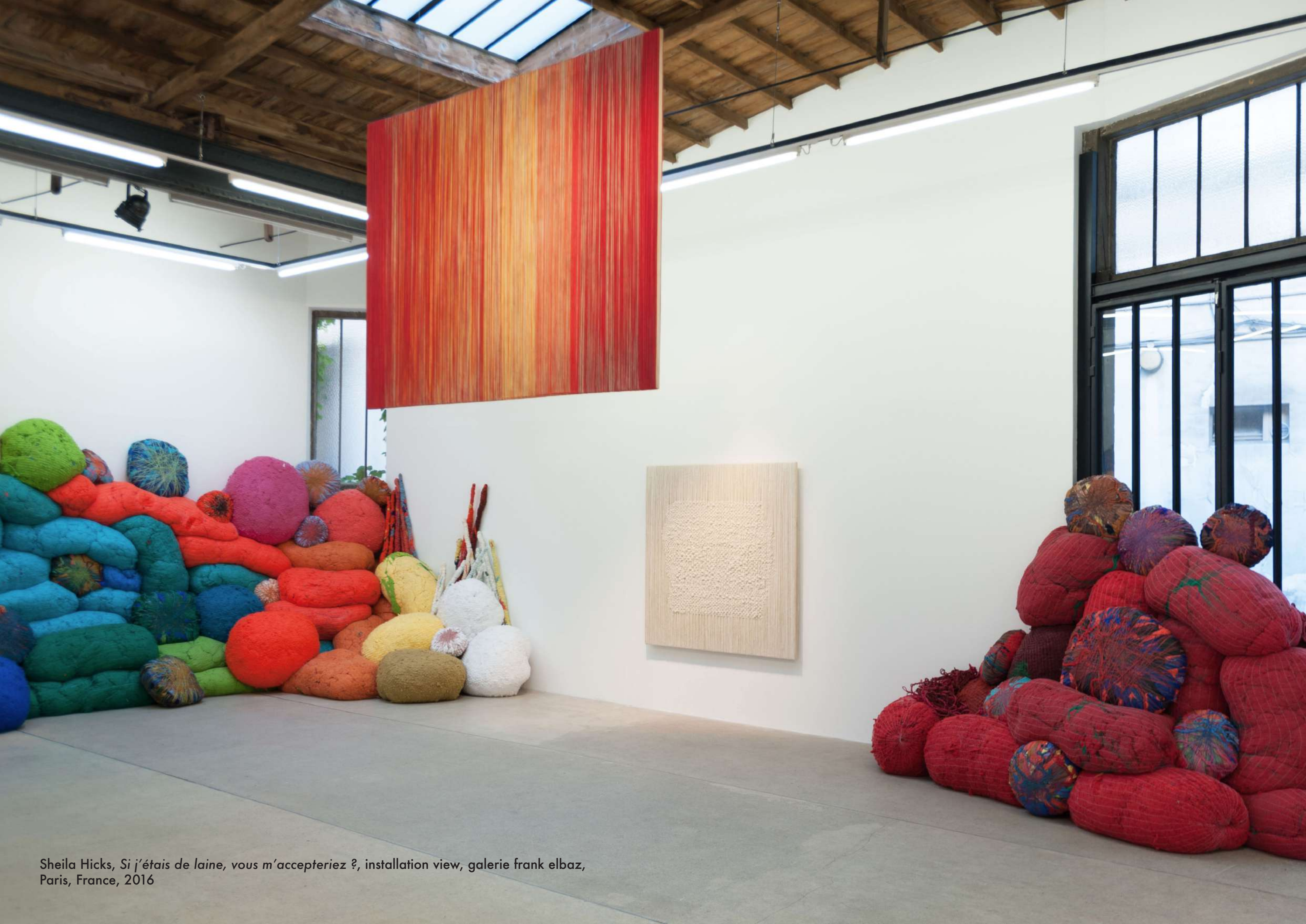
Sheila Hicks, Si j'étais de laine, vous m'accepteriez ? , installation view, galerie frank elbaz, Paris, France, 2016