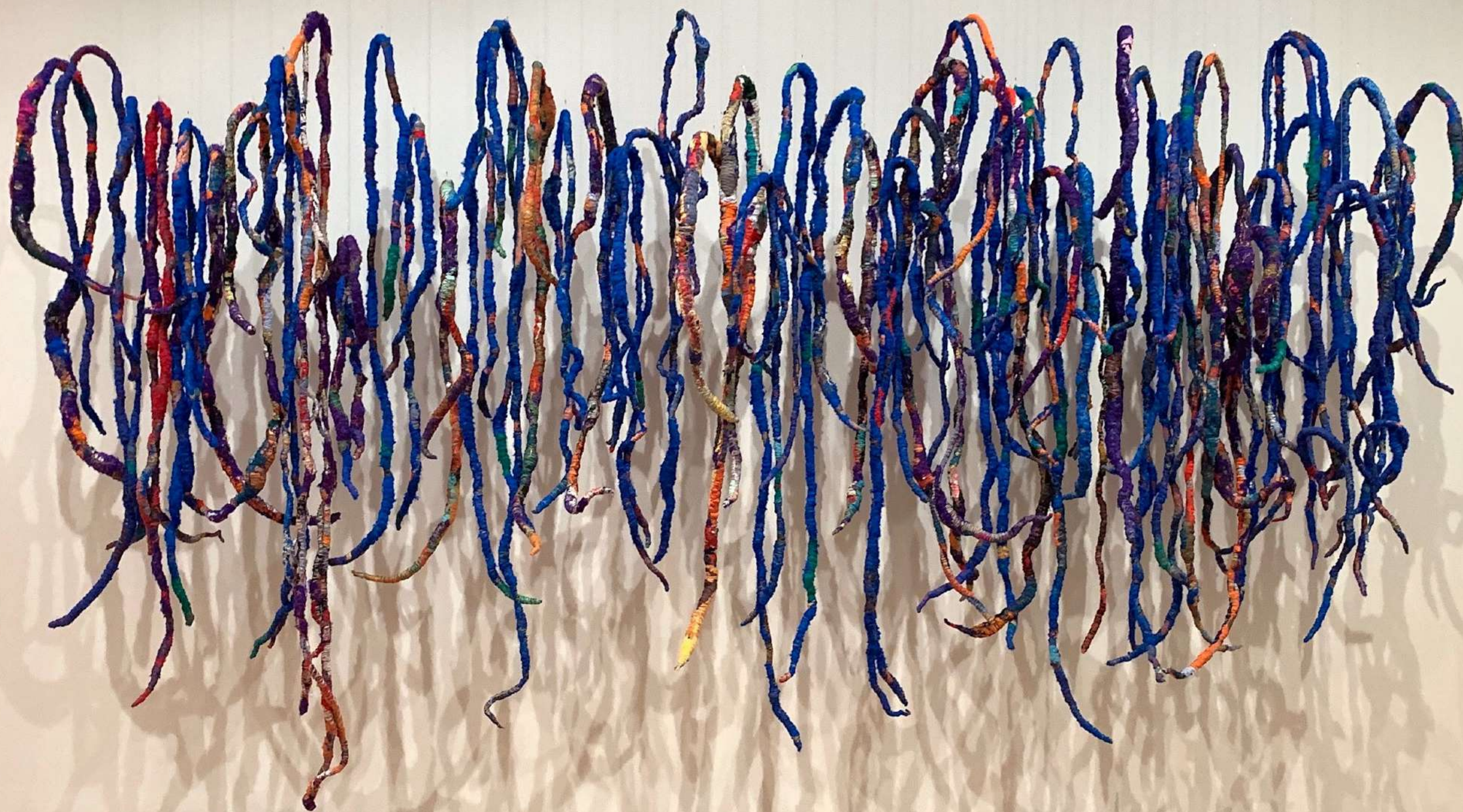
Sheila Hicks Baôli Chords , 2014-2015 Cotton, wool, linen, silk, leather and synthetic fiber Installation view, Seize , Weave Space, Nasher Sculpture Center, Dallas, TX, USA, 2019