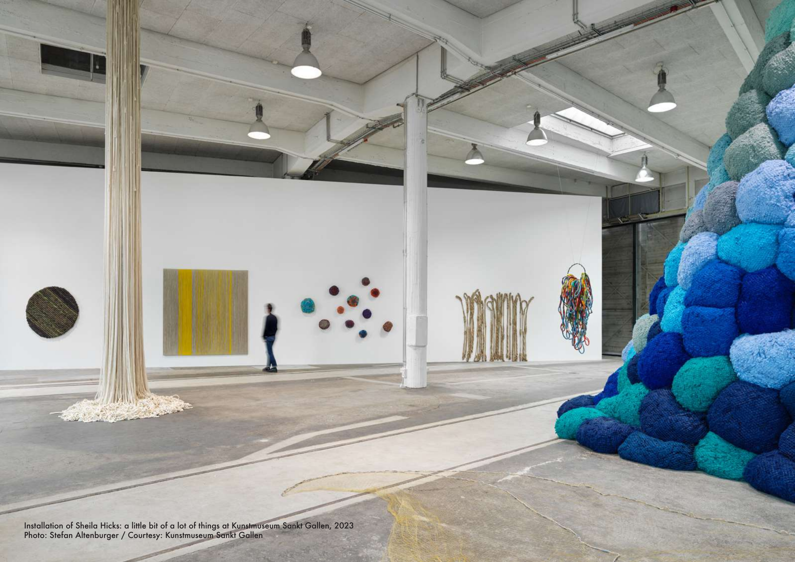
Installation of Sheila Hicks: a little bit of a lot of things at Kunstmuseum Sankt Gallen, 2023