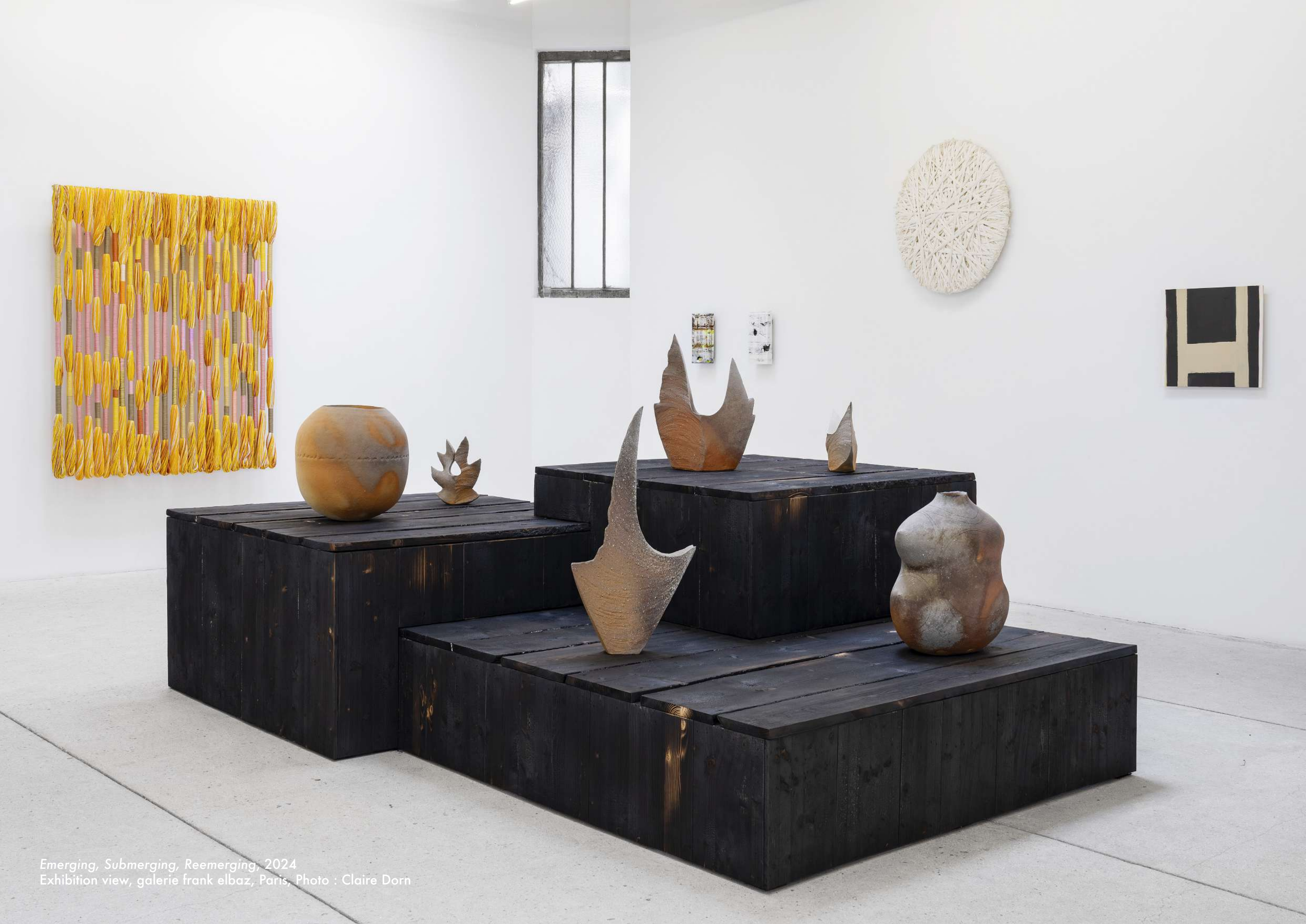
Emerging, Submerging, Reemerging, 2024 Exhibition view, galerie frank elbaz, Paris