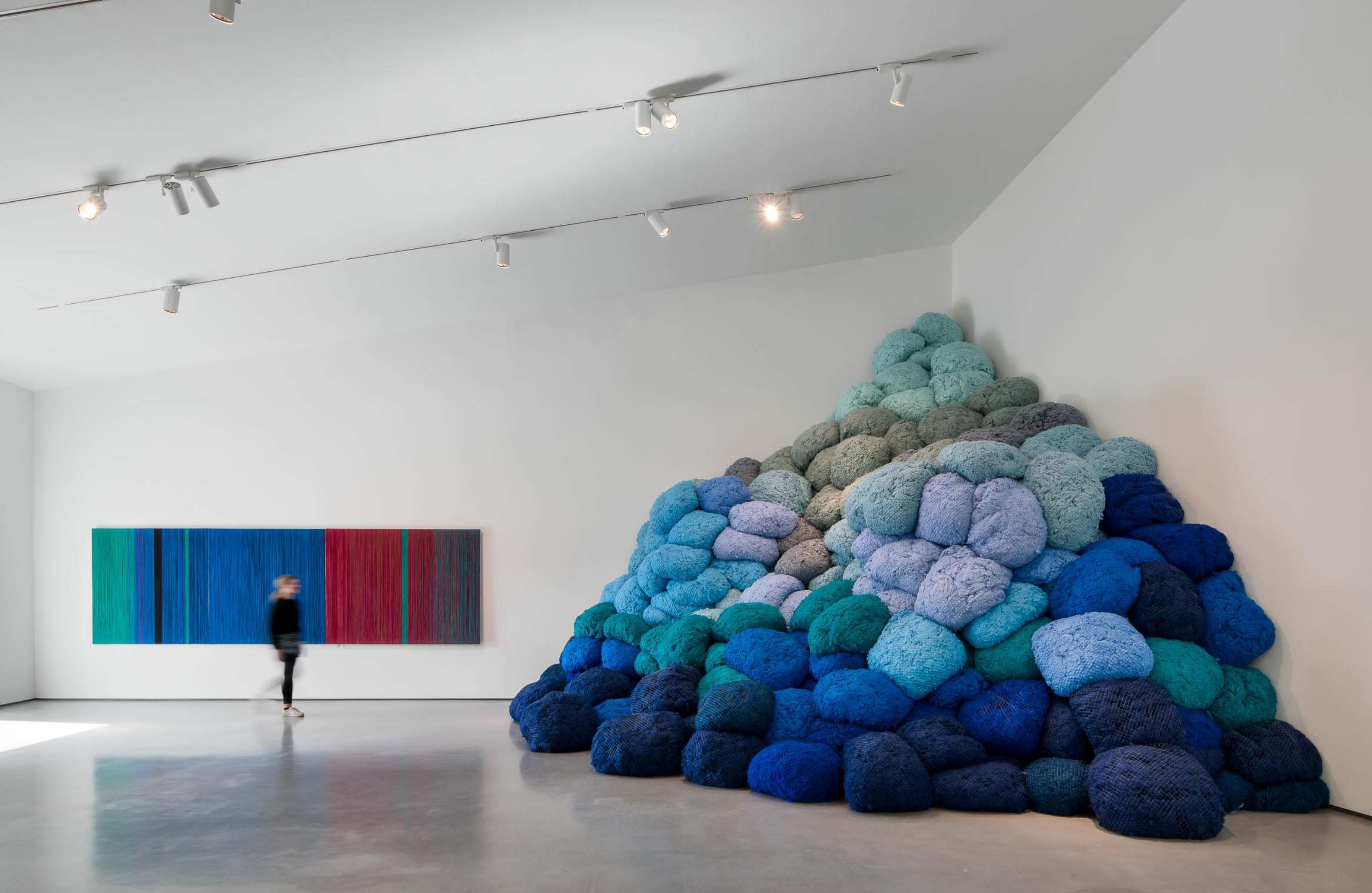
Installation of Sheila Hicks: Off Grid at The Hepworth Wakefield, 2022