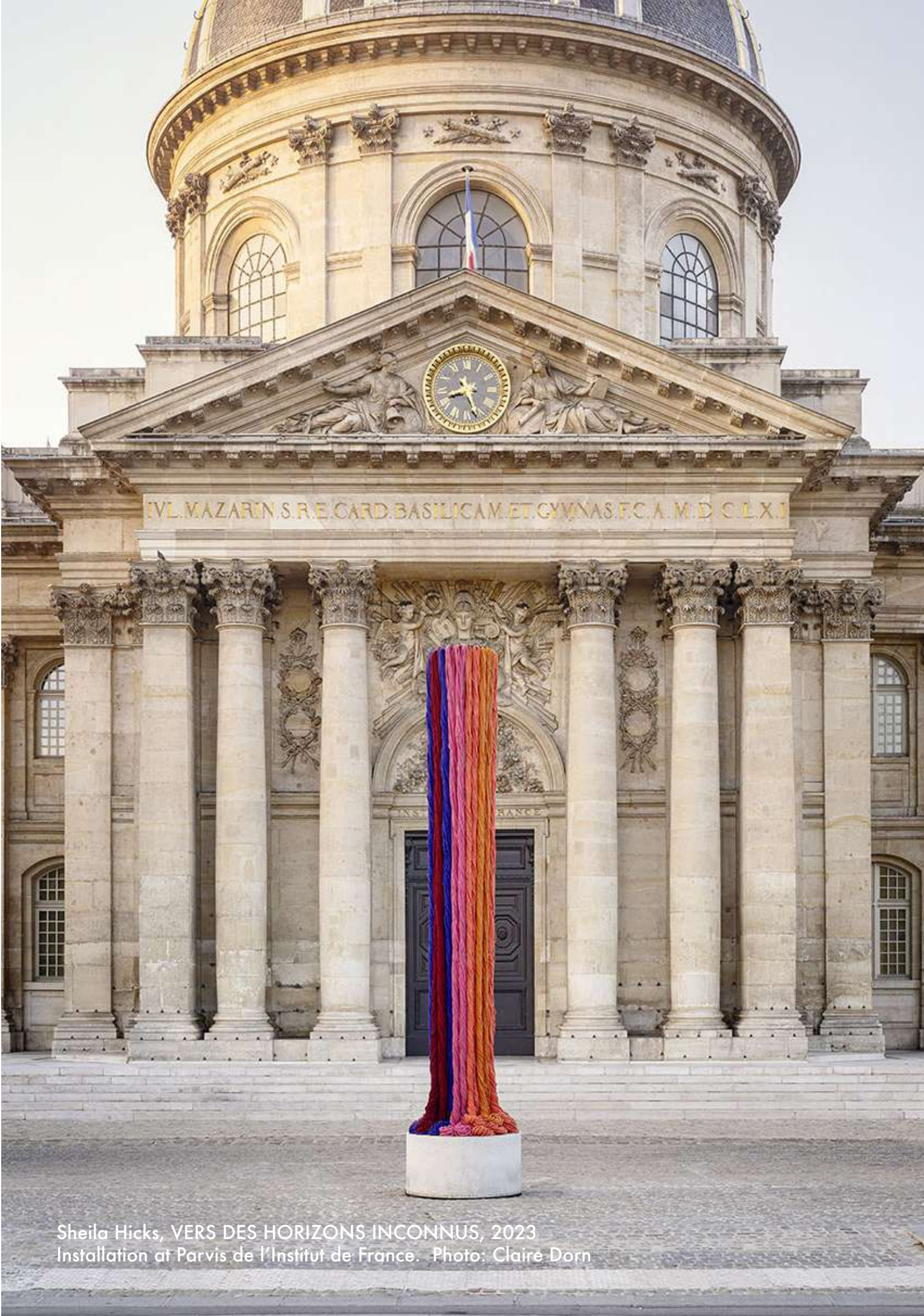
Sheila Hicks, VERS DES HORIZONS INCONNUS, 2023 Installation at Parvis de l'Institut de France.