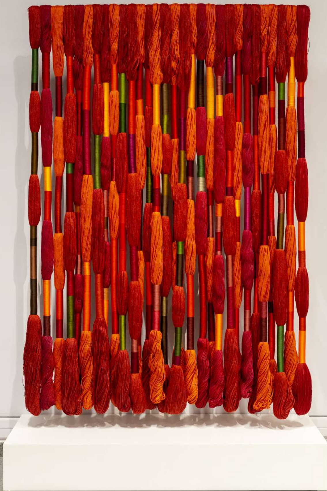
Sheila Hicks, Sheila Hicks: Reencuentro , installation view, Museo Chileno de Arte Precolombino, Santiago, Chile, 2019