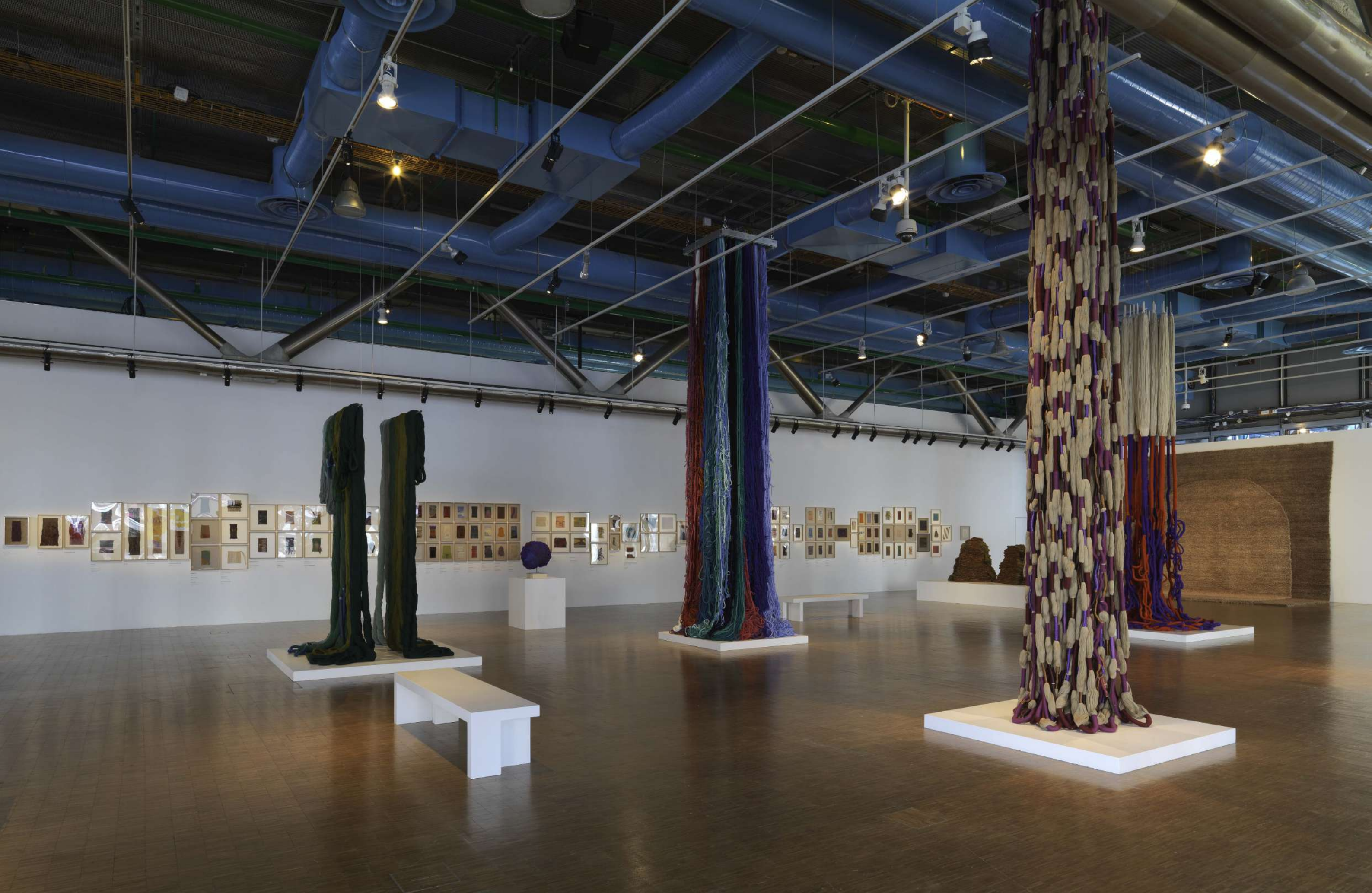
Sheila Hicks, Lignes de vie , installation view, Centre Pompidou, Paris, France, 2018