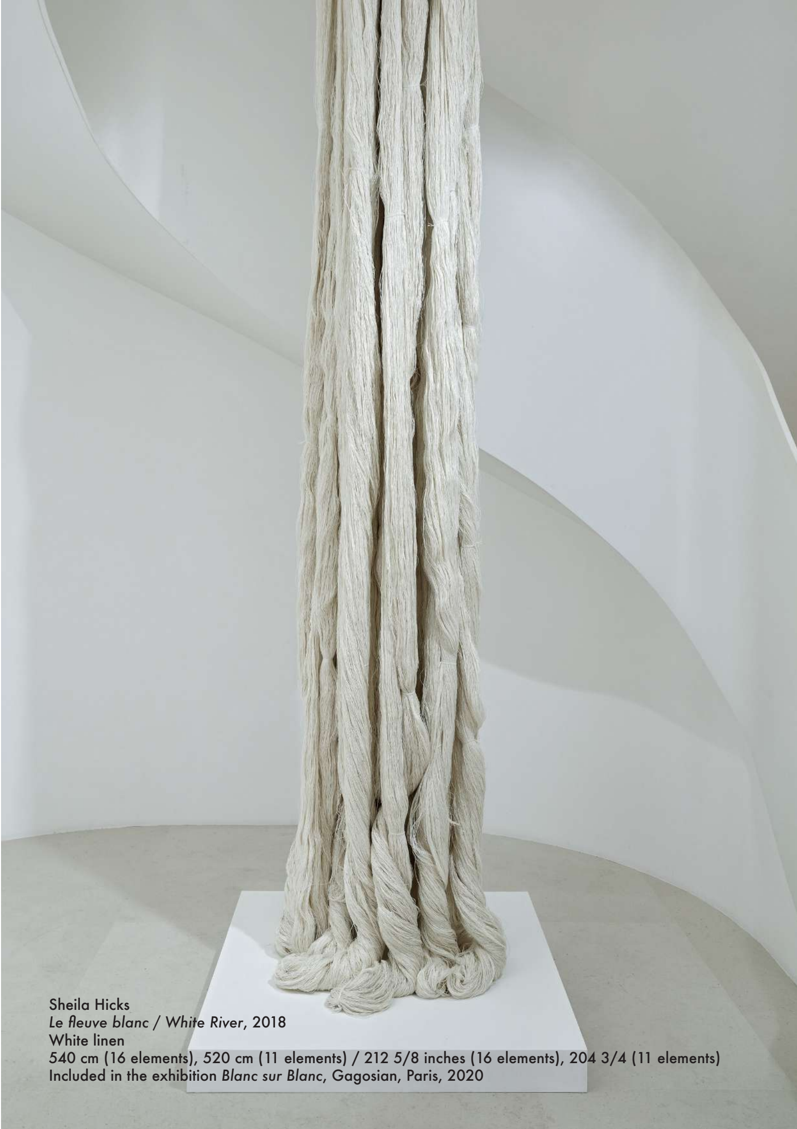
Sheila Hicks Le fleuve blanc / White River , 2018 White linen 540 cm (16 elements), 520 cm (11 elements) / 212 5/8 inches (16 elements), 204 3/4 (11 elements) Included in the exhibition Blanc sur Blanc , Gagosian, Paris, 2020