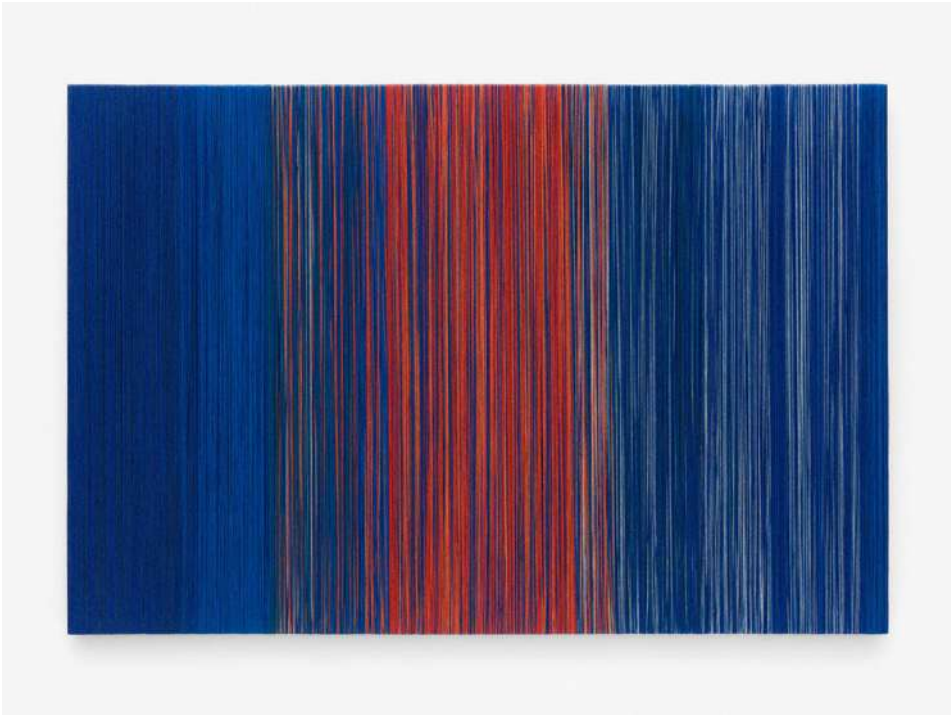
Sheila Hicks, Sunset Contained Forever, 2023, linen mounted on wood with metal support, 1.2 × 1.8 m.