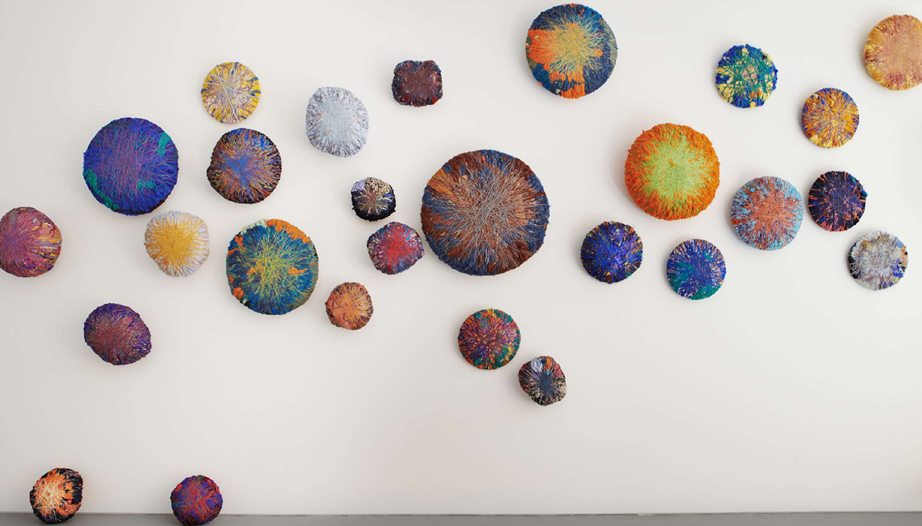
Sheila Hicks, Migdalar , installation view, Magasin III Jaffa, Israel, 2018