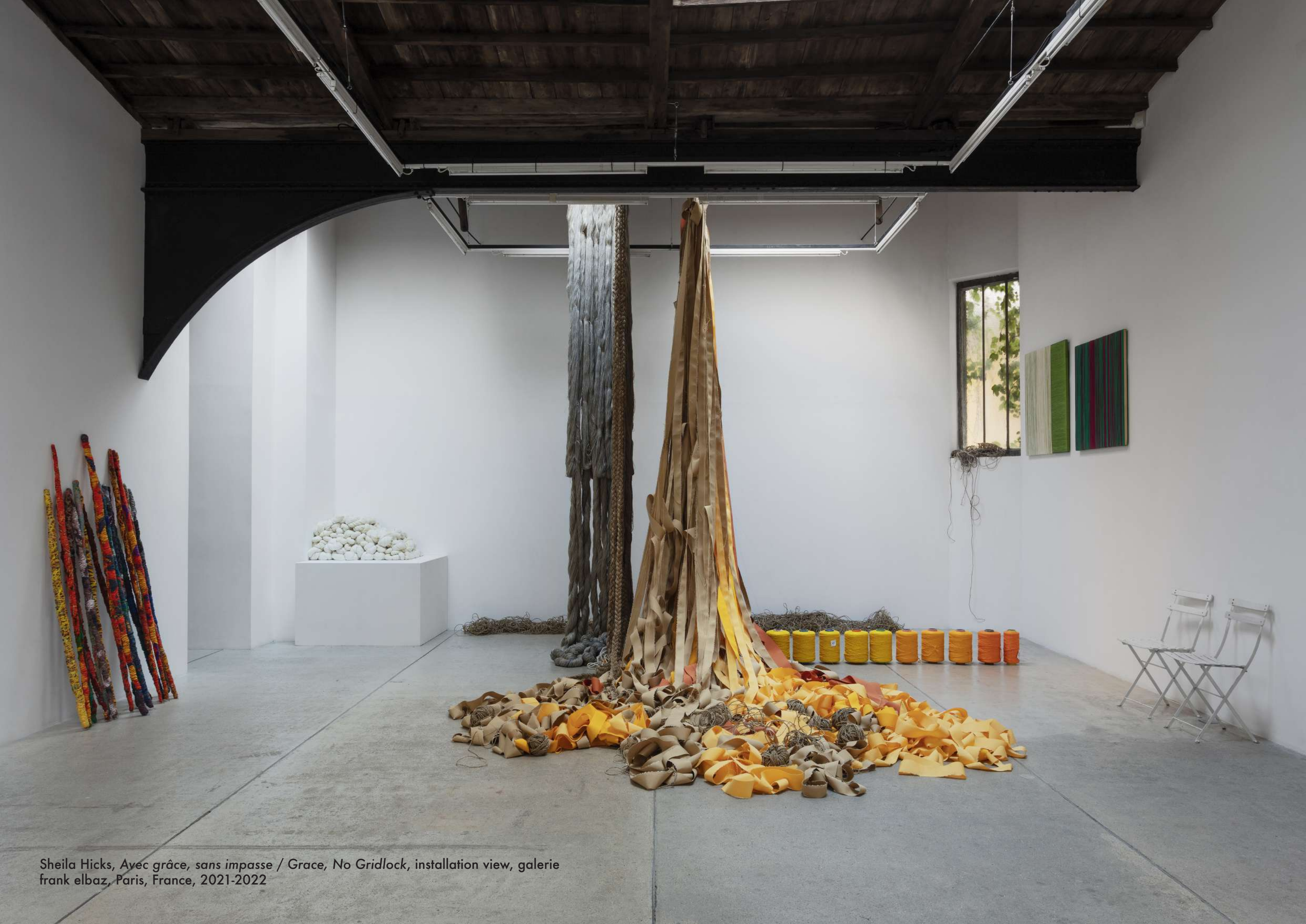
Sheila Hicks, Avec grâce, sans impasse / Grace, No Gridlock , installation view, galerie frank elbaz, Paris, France, 2021-2022