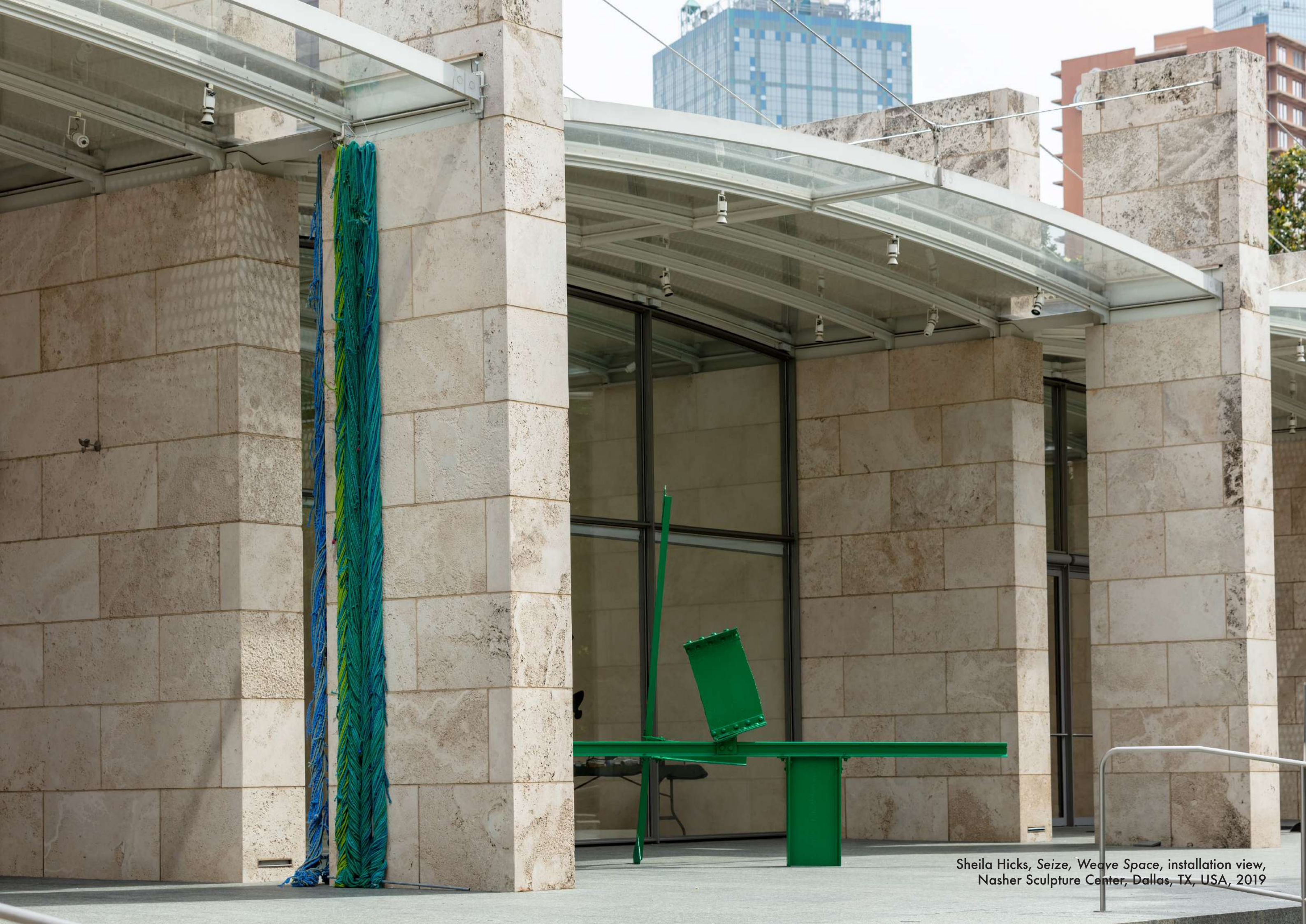
Sheila Hicks, Seize, Weave Space , installation view, Nasher Sculpture Center, Dallas, TX, USA, 2019