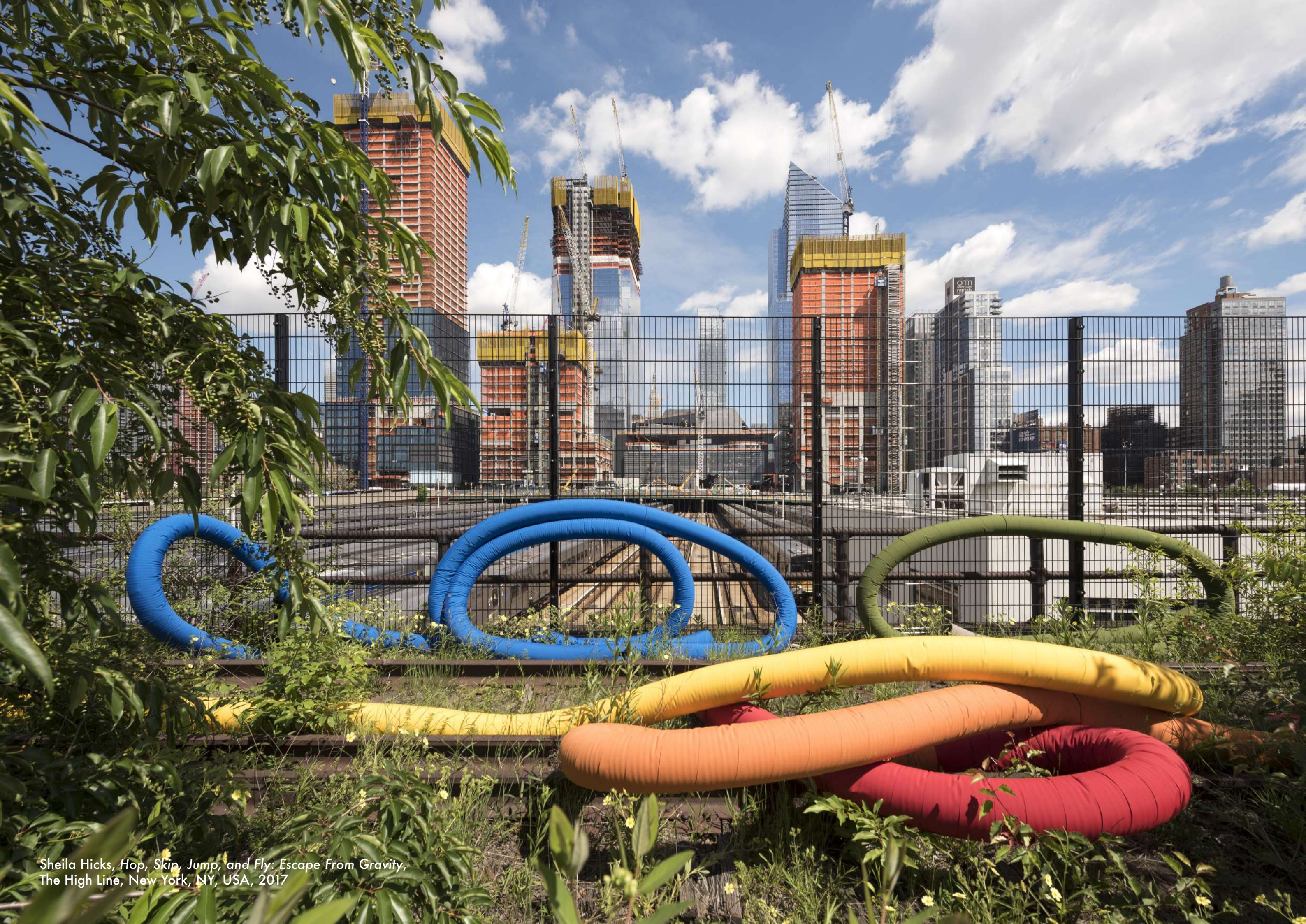
Sheila Hicks, Hop, Skip, Jump, and Fly: Escape From Gravity , The High Line, New York, NY, USA, 2017