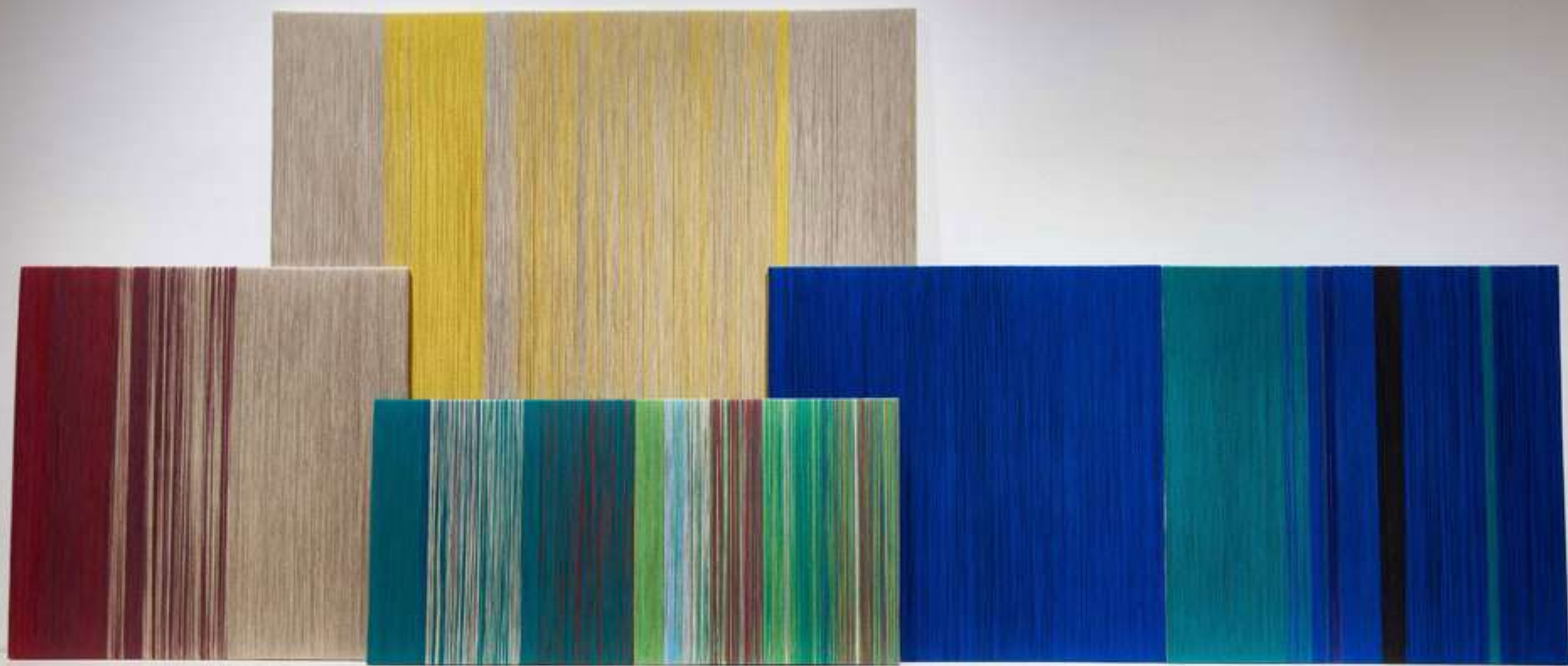
Sheila Hicks, Thread Trees , installation view, MAK, Wien, Austria, 2020