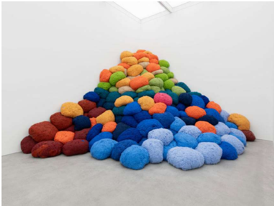
Sheila Hicks, Infinite Potential, 2023, pigmented acrylic fibre, 2.7 × 7.9 m. Courtesy: Alison Jaques, London

I feel a more rigorous discussion that included reflection on Hicks's positionality in relation to her eclectic influences, which include Mexican textile traditions and pre-Inca cultures, would not detract from her work's significance; it would enrich it. 'Infinite Potential' does not take the opportunity to develop such a discussion. Although most of the works included are new or recent, the exhibition seems to repeat familiar narratives: the formative influence of early mentors; Hicks's many collaborations with architects; and the importance of travel, especially in South America. Aside from a brief mention of environmental responsibility via the occasional use of some recycled materials, the show presents a wealth of elegant objects but leaves me with a desire for more criticality surrounding their conceptual and material formation.