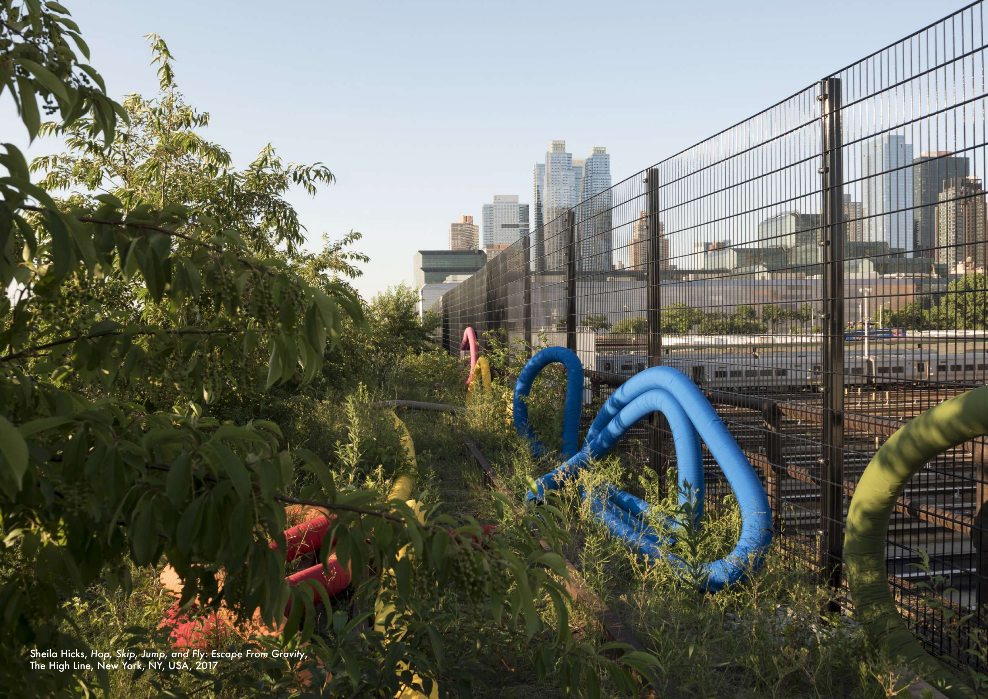
Sheila Hicks, Hop, Skip, Jump, and Fly: Escape From Gravity , The High Line, New York, NY, USA, 2017