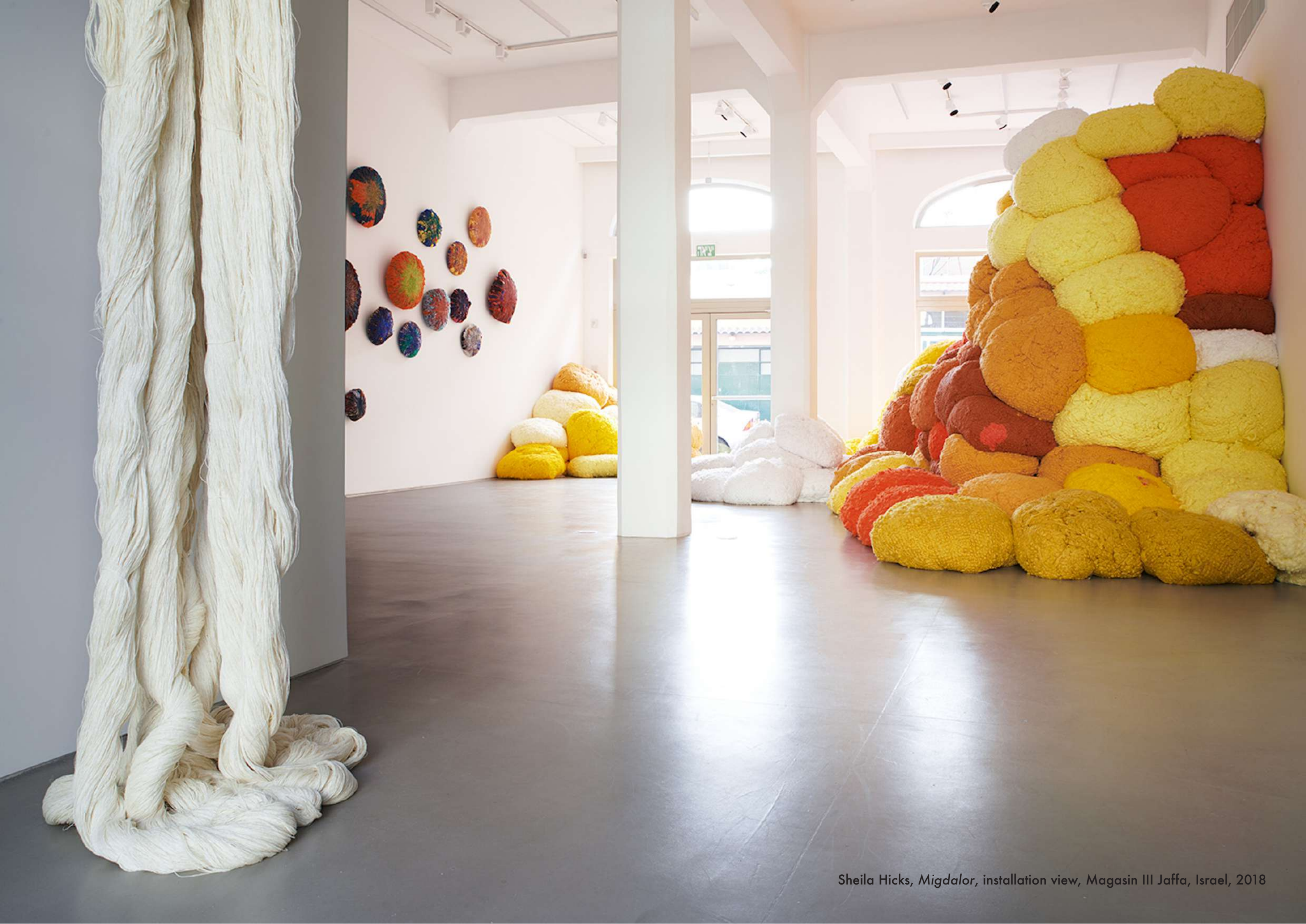
Sheila Hicks, Migdalar , installation view, Magasin III Jaffa, Israel, 2018