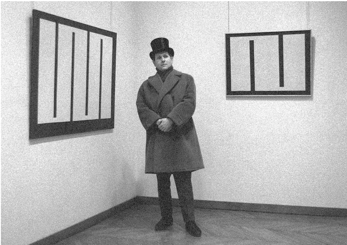
Julije Knifer exhibition in GGSU, 1965.

Julije Knifer was born in Osijek, Croatia, on April 23, 1924. His early interest in the arts led him to move to Zagreb after World War II, where he initially enrolled in the Faculty of Law before fully committing to his passion at the Academy of Fine Arts in Zagreb. It was here that Knifer's singular vision began to truly take shape.